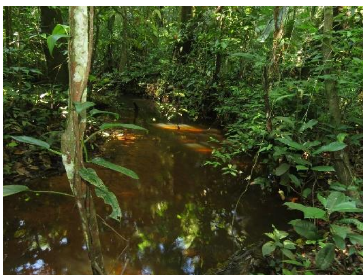
Figure 2: Part of the Vaca Stream studied.

The Vaca stream is about 2 meters wide and 60 centimeters of deep, while the Água Amarela stream is about 3,5 meters wide and 80 centimeters of deep, both have a moderate currents, bordered by gallery forests located in a transitional area between two Brazilian biomes - Cerrado and the Amazon Forest (Fig. 2 e Fig.3, respectively). The Água Amarela Stream is 6,680m long. It has 3 tributaries with: 2,021m, 563m, 517m. Nascent coordinates: 7°6'44.70 "S, 48°13'45.94 "W. The Vaca Stream is 4,656m long. It has 05 tributaries with: 121m, 884m, 653m, 2,293m, 695m. Nascent coordinates: 7°7'56.24 "S, 48°12'10.10 "W.