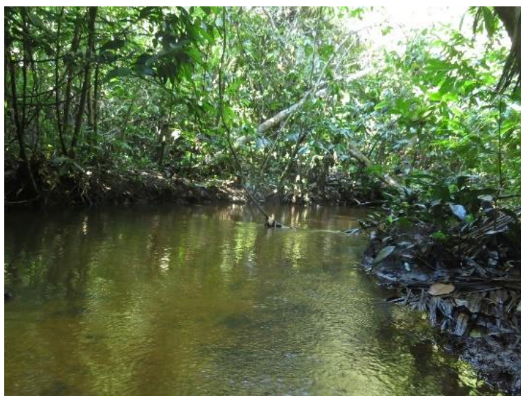
Figure 3: Part of the Água- Amarela Stream studied.