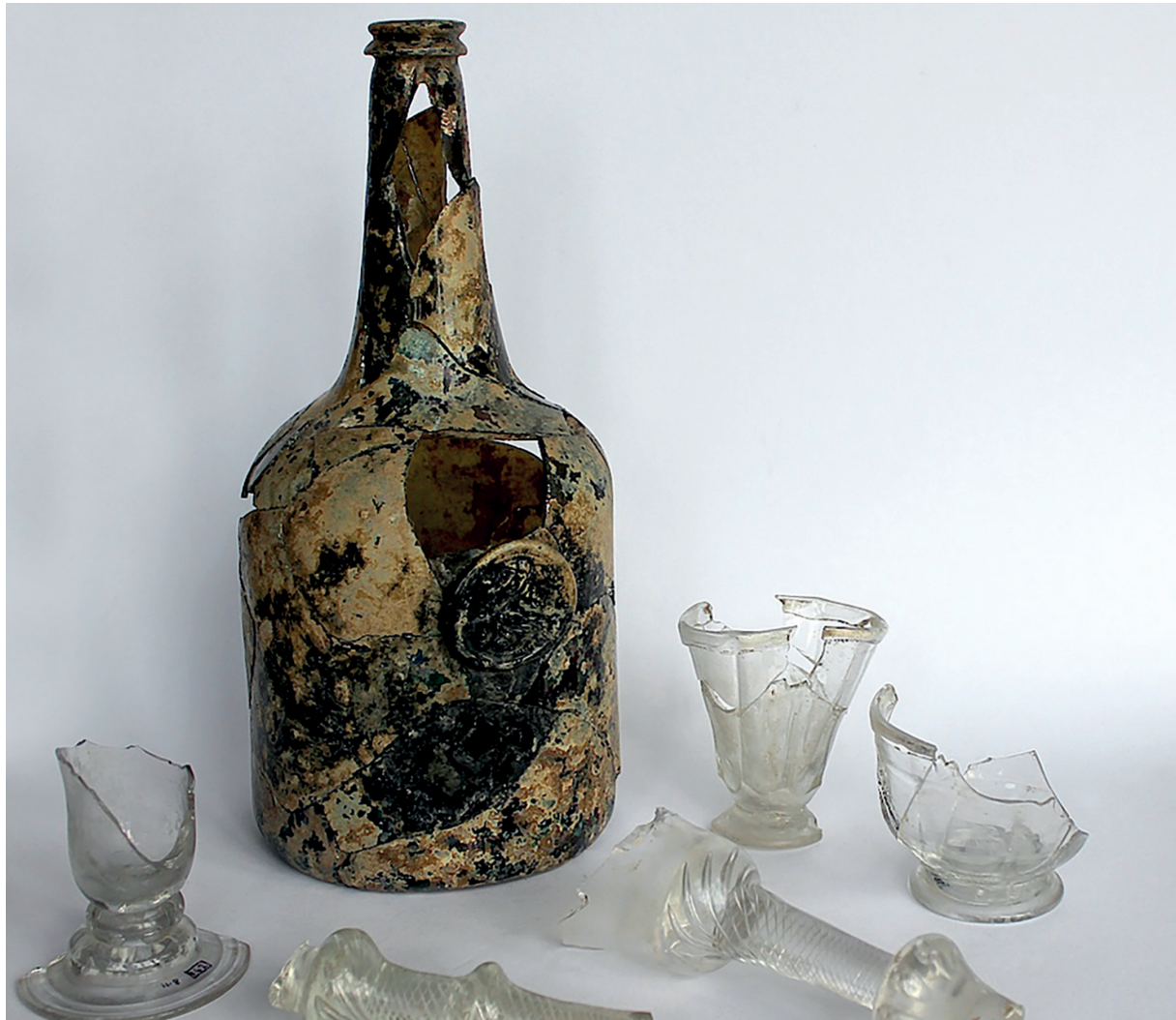
Glassware recovered from the excavation of Gawthorpe Hall, including (clockwise from top) a mallet bottle with the Lascelles' seal (c.1750), two handled punch cups (mid-18 th century), two stems from drinking glasses with air twist patterns (c.1745-50), and a fragment of a jelly glass (c.1730-50).

This move contrasts the situation in Denmark, for example, where even newly built manor houses were still closely connected to these facilities as signs of their manorial privileges in the eighteenth century. In England, where manorial rights had been commuted to cash from the fifteenth century, the spatial arrangements in the landscape reflected new relationships between owners, land and power. The demolition of Gawthorpe Hall and the construction of Harewood House and the associated re-landscaping of the estate was the epitome of the new relationships of a modern, capitalist society.