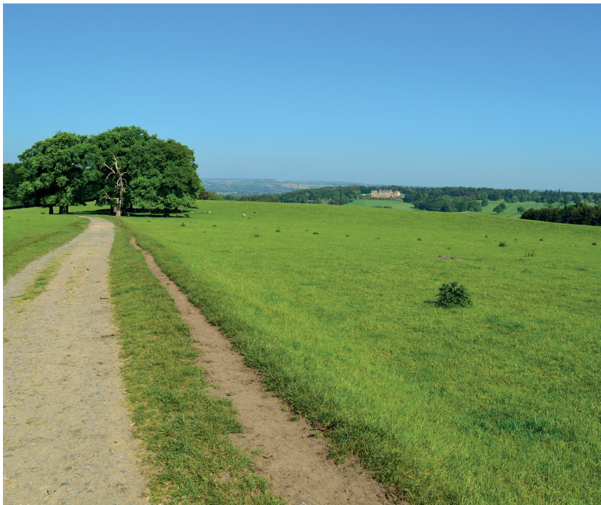
Harewood House from the Lofthouse coach road. The coach road was laid out by 'Capability' Brown to give a series of framed views of the house in its landscape setting. From the start of the drive the house is seen in the middle distance framed by the trees of the northern pleasure ground beyond. The road then dips down, crosses the stream which feeds the lake Brown built, and presents dramatic views of the house from below.

in 1366 and stands high above the river Wharfe as a symbol of lordly power, surrounded by a small deer park. Built as a fortified house, it combined wide domestic windows on the upper floors with the imposing walls of a stronghold, but it stood ruined by the seventeenth century after the family had died out and the estate was united with the smaller and later manor of Gawthorpe . By the early nineteenth century the romantic ruin had been incorporated into the northern pleasure grounds surrounding the Lascelles' classical house. Within the same northern grounds between the castle and the new house stands the medieval parish church, isolated and at some distance from the village. The church fabric is largely fifteenth century, and within it is a unique collection of alabaster tombs from the fifteenth and sixteenth century, including the armoured effigies and bejewelled ladies of the Redman and Ryther families who owned Harewood Castle ; their armour reflecting the feudal roots of their status as lords of the manor, and providing a convenient history by association for the recently enriched Lascelles family.