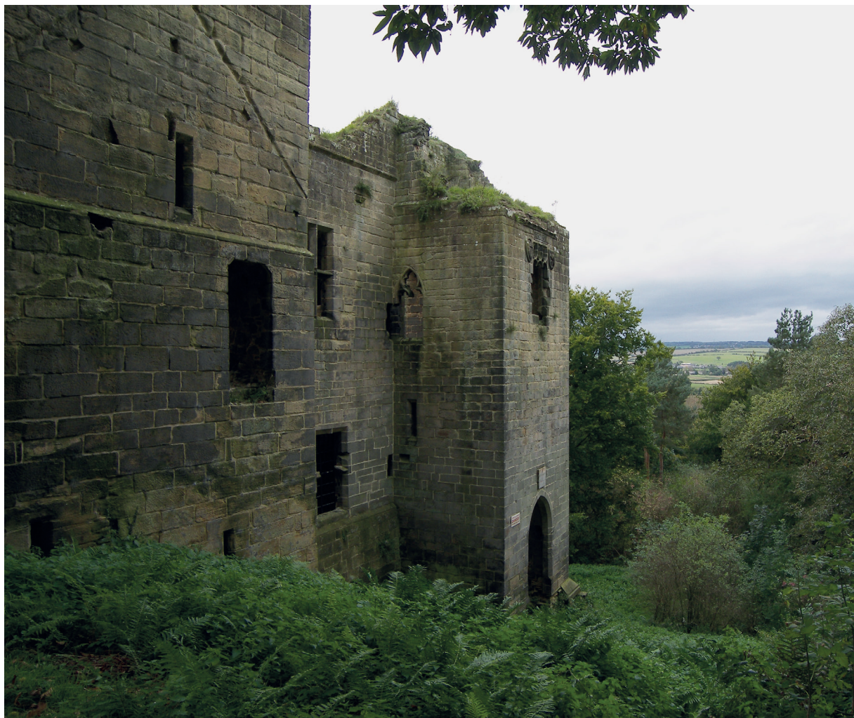
The remains of Harewood Castle overlooking Wharfedale. Built in 1366 for the Aldeburgh family, whose heraldry can be seen decorating the upper window of the chapel above the main entrance. Its large windows demonstrate a growing concern for domestic comfort over defensive capabilities, but its towers, height, and position still recall its military antecedents.