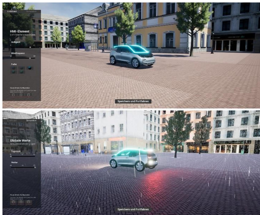
Figure 2. User interface and view on the HMI during the configuration session

configuration has been added to load saved designs for later comparison and was requested during pretest. The T2 tab includes additional environment parameters such as weather (sunny, clouded, rain) and daytime (day time, night time, afternoon/sunset), see Figure 1. User were able to configure the vehicle's HMI as well as the global parameters based only on the predefined subset and subrange. Sliders and buttons were implemented to give users control over their decision while having changes to the simulation immediately shown when applied during configuring. During the scenario session up until the AV stopped, participants were not able to move to prevent accidental distancing from the scenario. After that, keyboard input for moving around were enabled. View direction could be changed at any point to look around. The environment depicted in Figure 2 shows the approaching car within the shared space scenario with the user's perspective. Besides the vehicle to interact with, there were other moving objects like cars on the street and people on the sidewalk.