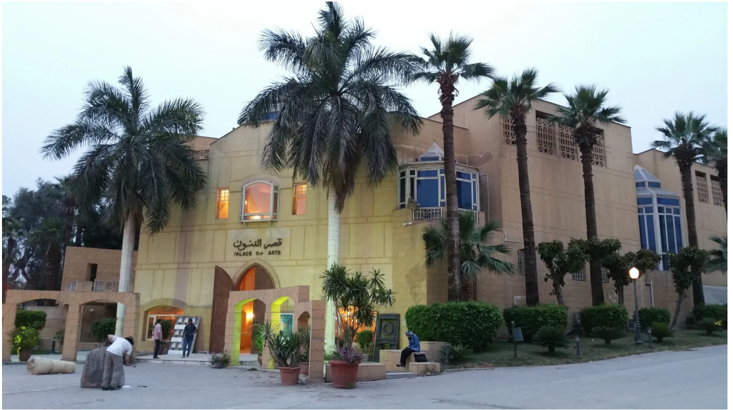
Exhibited Palace of Arts, Cairo at Cairotronica, a Symposium of Electronic and New Media arts in Cairo, Egypt. 03-10/05/2016.