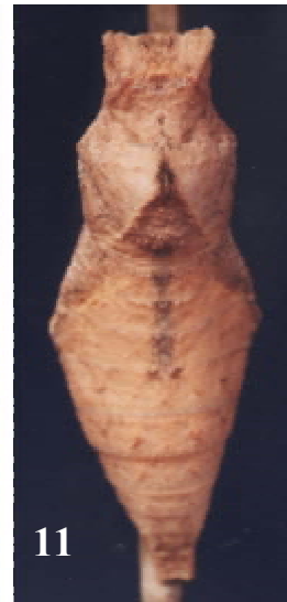
Figs. 1-11. Immature stages of Papilio demoleus from lower Sindh, Pakistan.