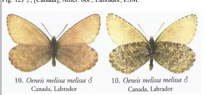
Fig. 3. Illustration of "neotype" of Oeneis melissa (Fabricius, 1775) by Lukhtanov and Eitschberger (2000) – transcription of text and copy of images:

Fig. 11) \ , [Canada], Labr[rador] merid.[ionalis], islandia; EMEM. Fig. 12) \ , [Canada], Amer. bor., Labrador, ZSM.