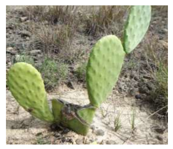
Fig. 5. Infested cladode of spineless O. ficus-indica in cultivated field in District Chakwal.

After planting, all fields were visited once a month. The growth of O. ficus-indica was found to be excellent in all the targeted fields until November 2016. However, during the December 2016 survey it was observed that a few cladodes of O. ficus-indica were found dead with infestation of an unknown pest ( Fig. 5 ). All infested pads were removed and burned. In December 2017, the same infestation was again reported and the majority of the cladodes were found to be infested. Infested cladodes were examined in the field and some lepidopterous larvae were found inside the cladodes ( Fig. 6 ). Larvae were brought to the laboratory of the National Insect Museum for identification. However, in July 2019 it was found that cultivated O. ficus-indica at all the three localities had completely vanished due to the heavy attack by cactus moth larvae (Figs. 7 & 8).