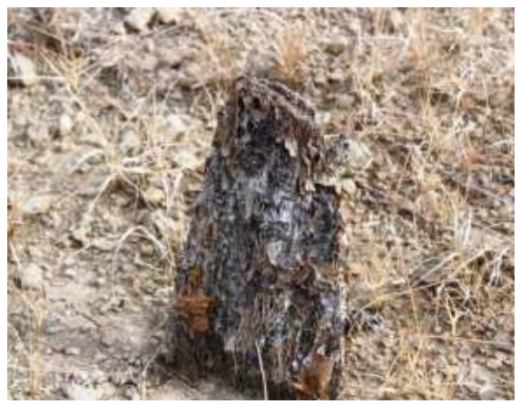
Fig. 7. Dead cladode of O. ficus-indica in vanished field in District Chakwal.