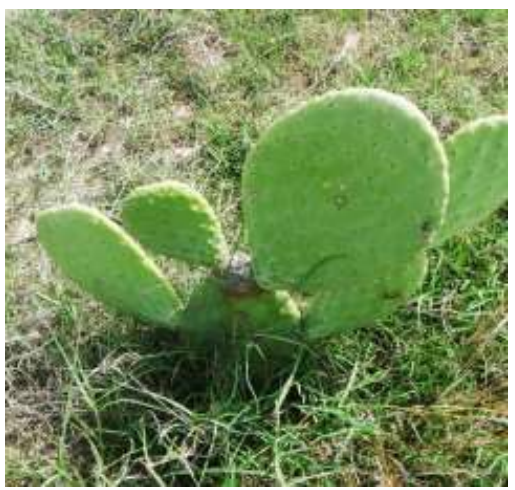
Fig. 4. Cultivation of spineless cactus O. ficus-indica under AIP in Chakwal for fodder purposes.