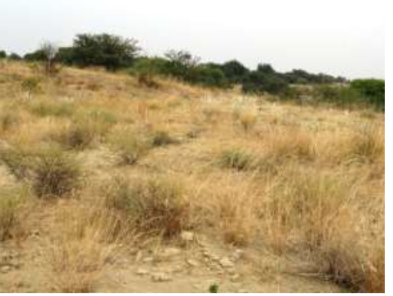
Fig. 8. Completely vanished field of O. ficus-indica in District Chakwal.