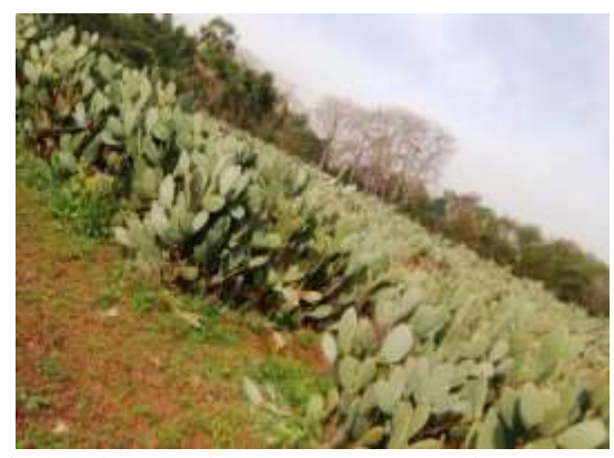
Fig. 2. Imported Cacti germplasm at National Agricultural Research Centre (NARC), Pakistan.

The district Chakwal is located at 32°56′17″N, 72°51′30.71″E., on the Pothohar Plateau, Punjab, Pakistan ( Fig. 3 ). It is situated in the north of the Punjab province, bounded by district Khushab to its South, district Rawalpindi to its northeast, district Attock to its northwest, district Jhelum to its East and district Mianwali to its West. District Chakwal is comprised of four tehsils namely Kallar Kahar, Chakwal, Choa Saidan Shah and Talagang. Dominant flora of the Chakwal districts consists of Acacia modesta , Acacia nilotica and Dalbergia sissoo . Approximately 50% of the area is uncultivated and primarily used for grazing animals, and about 11% is natural grasses and shrubs. District Chakwal is the largest peanut producer in Pothohar region, where the peanut is largely grown in the tehsil of Chakwal and Talagang, and peanut stubble is the main stock to the small ruminants in the area. Due to high demand of peanut straw in large cities, the shrubby vegetation mainly supports the grazing of goats and sheep.