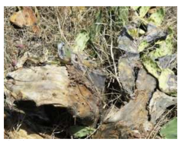
Fig. 10. Damaged wild cactus in District Chakwal.