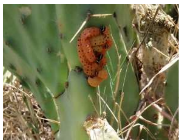
Fig. 9. C. cactorum infested cladode of wild cactus in District Chakwal.

After confirmation that the cladodes of cultivated O. ficus-indica were infested by the invasive moth, C. cactorum , plans were made to conduct detailed surveys for the whole district of Chakwal. Surveys were conducted for all tehsils of district Chakwal to discover the level of infestation of C. cactorum on wild Opuntia species which was introduced naturally/deliberated ( Figs. 8 & 9 ). Surveys were consecutively conducted from July 2019 to July 2021. During consecutive surveys over two years, it was found that sporadic plantation of wild cactus throughout the district Chakwal was in the stage of re-growing ( Fig. 11 ) from the debris of the cactus, which were damaged through the heavy attack of the larvae. However, larvae were found at various localities in tehsil Talagang of district Chakwal on wild cactus. In all surveyed localities wild cactus was severely infested by the cactus moth and threatened ( Figs 7 & 10 ). During this study establishment of C. cactorum has been confirmed after the introduction of the cactus moth larvae in the district Chakwal, Pakistan during 1994.