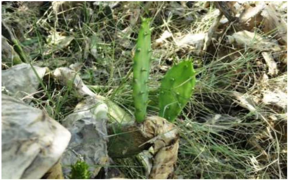
Fig. 11. Regrowth of cladode from debris/damaged cactus in District Chakwal.