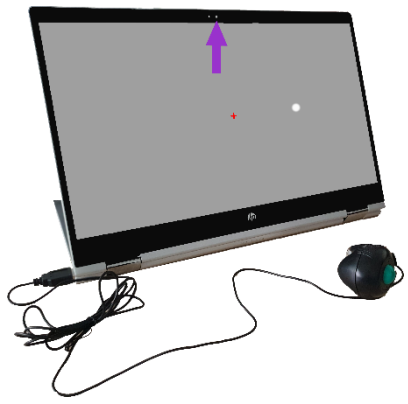
Figure 1 Eyecatcher testing was performed using homebased perimeter hardware. Participants completed the test monocularly and were asked to respond each time a white dot appeared with a button press using the attached handheld control. The red central point marks the fixation cross. The purple arrow shows the built-in webcam used to observe anomalous tests.