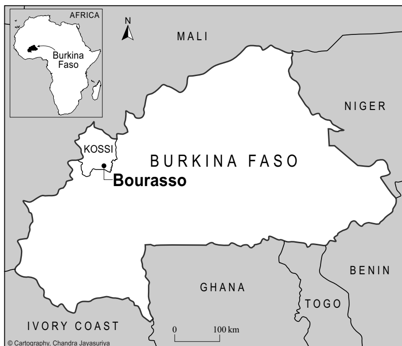
Fig. 3. Map of Bourasso, Burkina Faso (prepared by Chandra Jayasuriya).