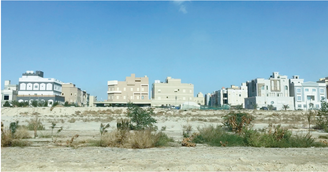
Figure 2: Examples of Kuwaiti Houses