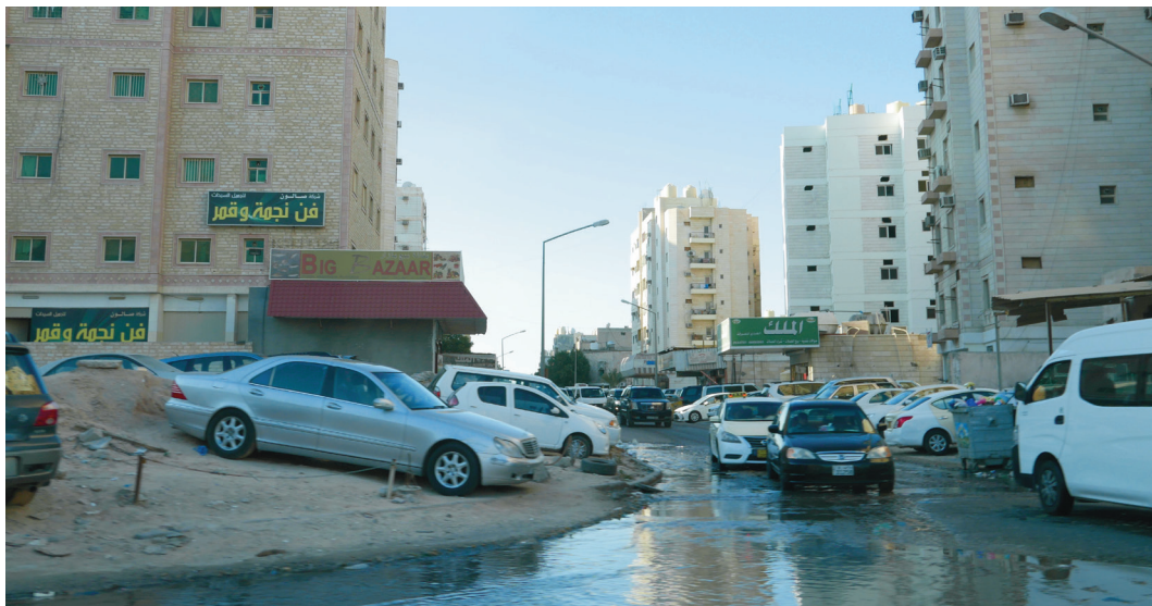
Figure 4: A Neighbourhood Where Housing for Migrants is Concentrated