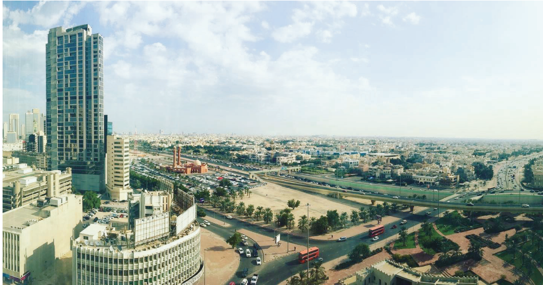
Figure 1: Kuwait City