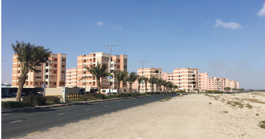
Figure 3: A PAHW-constructed Housing Estate Near North West Sulaibikhat