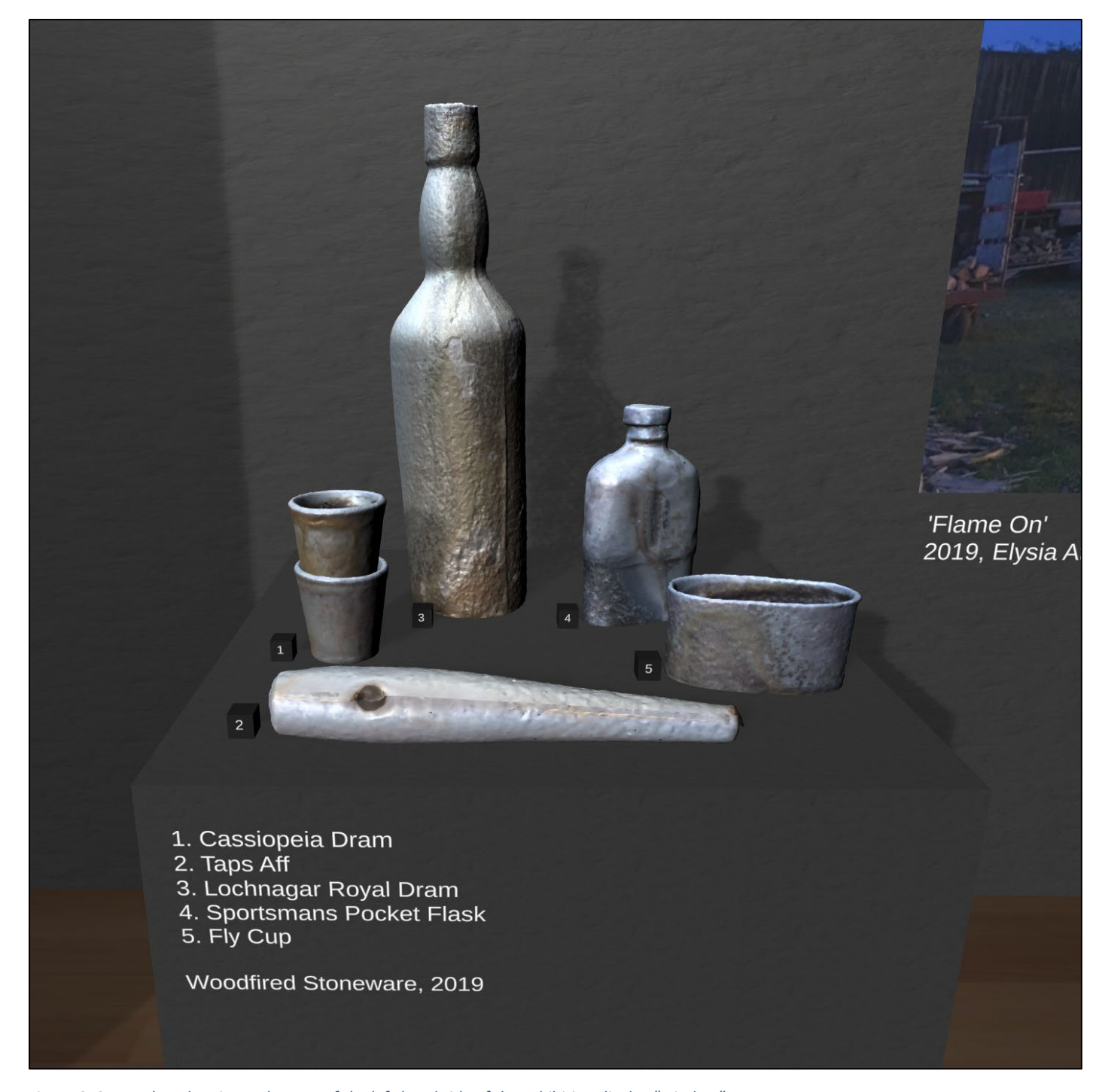
Figure 2. Screenshot showing a close-up of the left-hand side of the exhibition display "window".