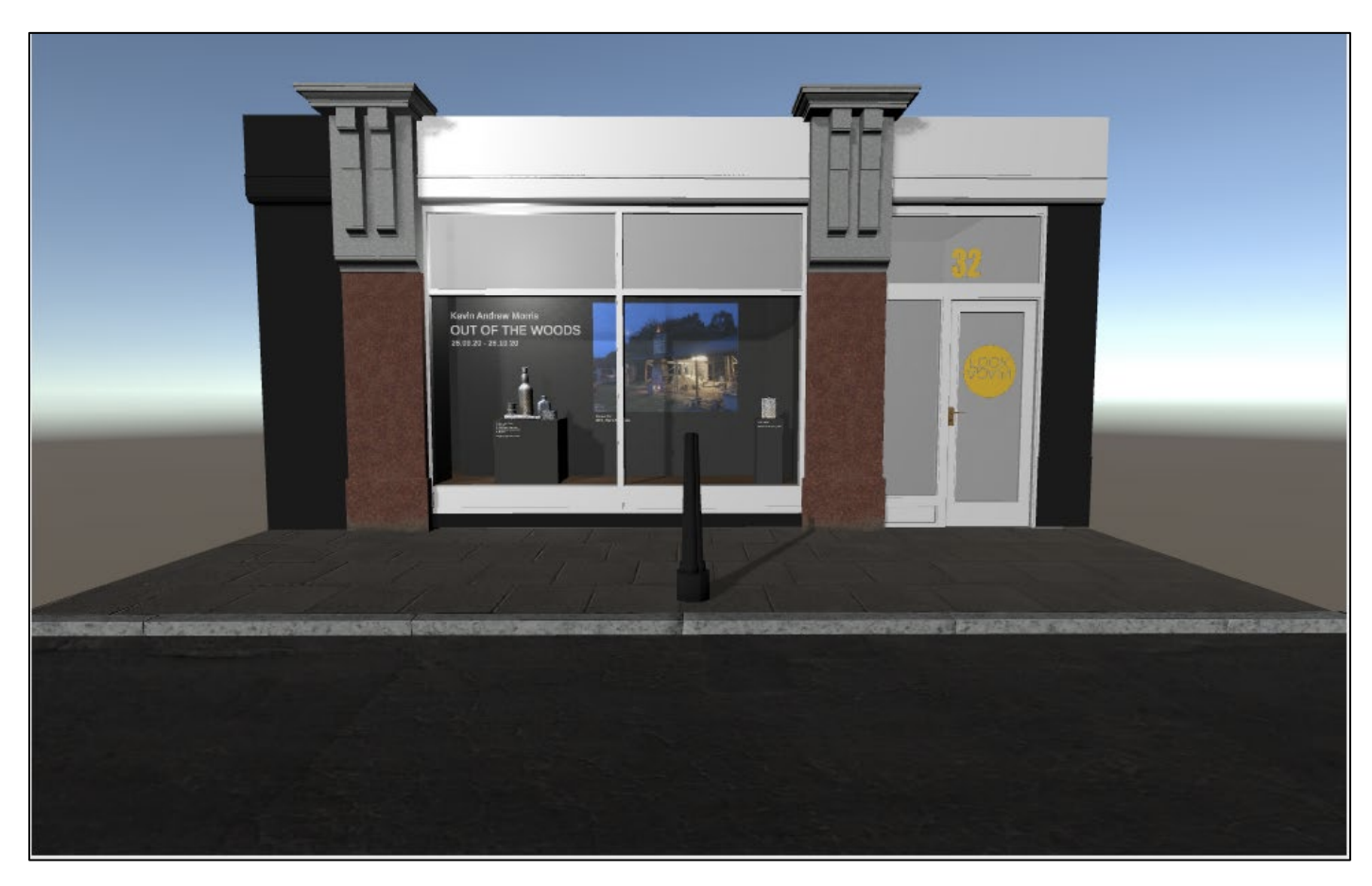
Figure 1. Screenshot of the user's first view when loading the virtual exhibition, showing the entire exhibition displayed as though in the front window of the Look Again project space in Aberdeen.