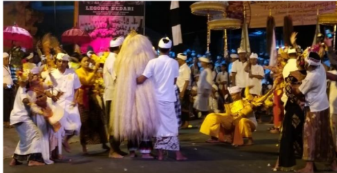
Figure 8. Sesuhuanan Rangda Ida Ratu Ayu Mas Maketel as the purusa pulls to the center, so that the 4 elements of Catur relatives are confused (trance)

community. Therefore, spiritual values are implied which are very thick with local wisdom and people's lifestyles.