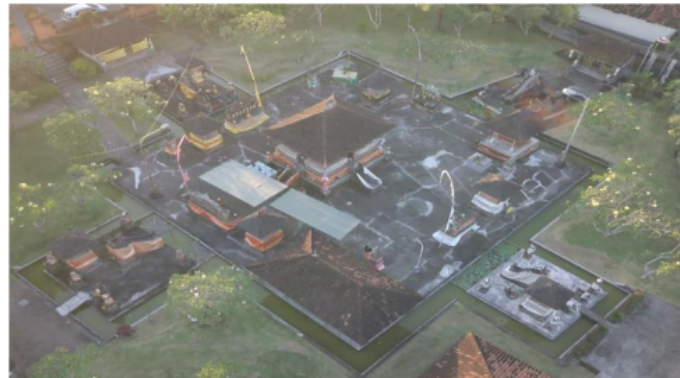
Figure 1. Photo of Kanda Pat Sari Temple