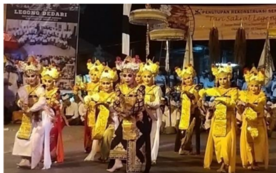
Figure 4. Legong Dedari Sacred Dance Performance at Kanda Pat Sari Temple

Art is synonymous with expression, expressed through the deepest feelings of the human soul. Feelings of emotion, sadness, joy, or anger that are being experienced by people are not possible to produce works of art at that time. In situations where people are experiencing problems, there will be a series of beautiful events in the soul's experience. After that feeling becomes an experience and is then contemplated, it is able to give birth to dance ideas. The idea is born due to an experience that intersects with an objective reality outside of itself or within itself which is manifested into a dance work. The idea becomes the main idea in a dance work or is the first consideration in the creation of a dance which is commonly called an idea. The idea is born because of the experience of the soul or problems in life that disturb the heart and want to be expressed in the dance media. Through ideas can make it easier understanding of the work. Therefore, it is expected to understand deeply the ideas that are worked on and really become the weight of the work. An idea is an abstraction of thought to be conveyed through a work of art.