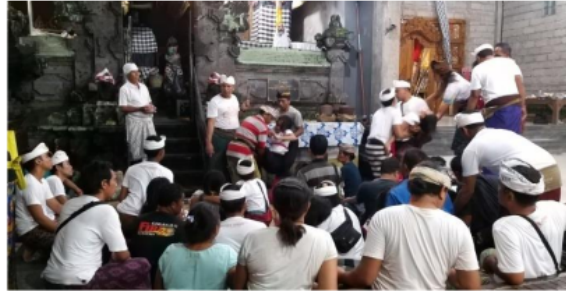
Figure 3. Prayers of dancers and musicians before a performance at Pamrajan Banjar