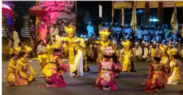
Figure 6. Two dancers in the Middle of interpretation of purusa and pradana (male and female) in the Kanda Pat Sari concept

and has quality in instinct. The experience is experienced, affects the beauty of the soul and desires to bring it into the theme of the dance work.