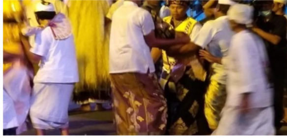
Figure 9. Catur sanak (red in the south, green in the north, white in the west, and yellow in the east) at the end of the kerawuhan dance (trance)