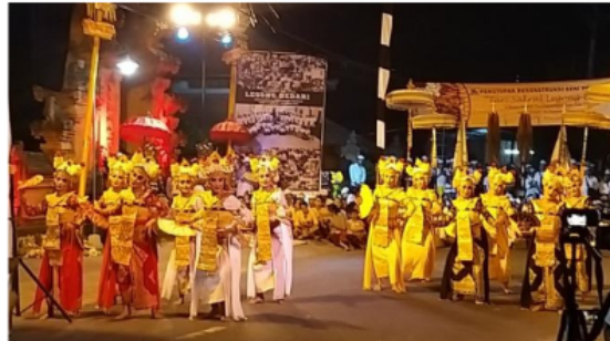
Figure 5. The floor pattern of the Sacred Legong Dedari Dance is in accordance with the concept of kinship Catur (East, South, West, and North)

Theme is the main idea about something that the artist wants to convey. In the creation of a dance work, the theme is a fundamental subject to develop motion into a dance strand that has meaning. The artist's belief in appreciating religious, aesthetic (beauty) and spiritual (spiritual) values into dance works is strongly supported by the method as a process of creating dance works. Imagination arises from contemplation of religious, aesthetic, and spiritual values which are developed through the terminal of the beauty of the soul, so that ideas can grow. The theme is the main thing in a dance, or a symbol that includes a thought, conception or view that can be internalized into the meaning of the work. The theme is based on the concept of Balinese life, which is thick with ritual nuances as rites for carrying out religious ceremonies, as well as being honest and being human with noble character.