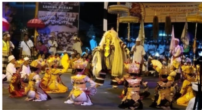
Figure 7. Arrangement of Rangda Ida Ratu Ayu Mas Maketel interpretation of the concept of purusa (centre//in the middle)

Inspiration for movement is very important in the Sacred Legong Dedari dance, so several ways are needed to show the quality of the movement. Doris Humphrey says, "The four elements of dance movement are, therefore: design, dynamics, rhythm and motivation" (Humphrey, 1958: 46). The ingredients for the composition or elements of dance moves are; design, dynamics, rhythm and motivation. The Sacred Legong Dedari dance design is a dance movement motif that is produced based on the merging of motion with the Kanda Pat Sari concept. The dynamics of dance movements can be seen in the style of motion that can cause changes in the strength of the motion. To show the atmosphere and the achievement of the climax, use rhythm as a measure or tempo of fast, medium, and slow motion. The spiritual concept of the Sacred Legong Dedari dance is motivated or driven by oneself, or the motivation to move of one's own will. The four ingredients of motion ingredients are always present in every movement, but to display must be selective based on reasoning considerations that can support ideas, themes, appearance and overall form.