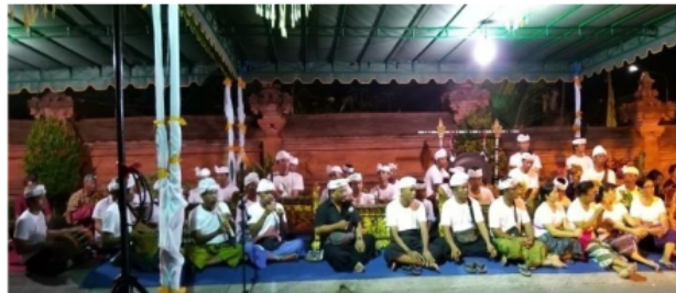
Figure 10. Gamelan music accompaniment to the Sacred Dance of Legong Dedari in Banjar Pondok, Peguyangan Kaja Village, North Denpasar, Denpasar City

The dance music that is meant is the music that accompanies the work of the Sacred Dance of Legong Dedari, using gamelan gong kebyar , although in fact there is a special type of palegongan gamelan that accompanies the Legong dance. Gong kebyar is a relatively young type of gamelan that was developed from a five-tone gamelan gong by doubling the octave to ten tones. The nature of this gamelan is able to transform the types of music in Bali into the form of performances. No wonder the development of gong kebyar is very popular and almost all banjar organizations in Bali have it, even to foreign countries wanting to practice the dynamics and phenomena of its presentation. The game and gong kebyar technique used in the performance of the Sacred Dance of Legong Dedari adapts to the palegongan gamelan standard. However, thanks to the development of the melody and the playing of the octaves are wilder, so the impression is less distinctive as a palegongan dish enjoyed from classic Legong works. However, this performance does not reduce its meaning and sacredness.