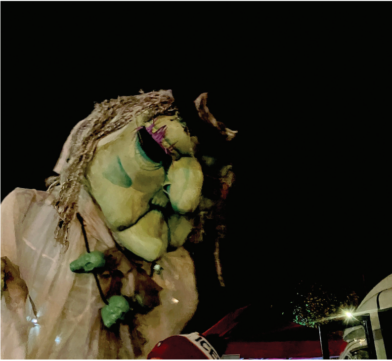
Figure 4. The Galoshans Granny Kempock puppet' here please.