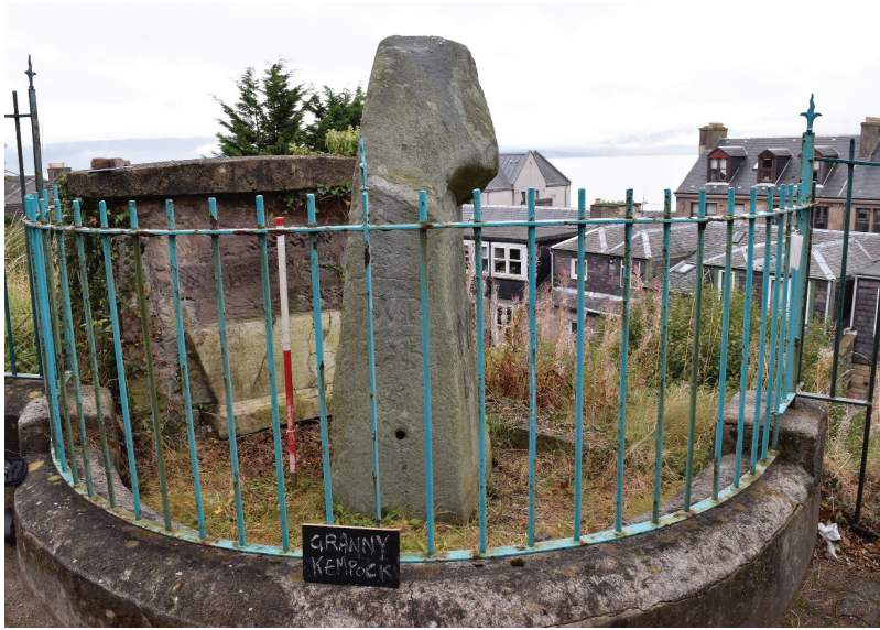
Figure 1. The Kempock Stone' .

assignment. Similarly, the brief description on the Canmore National Monuments Record of Scotland (Canmore, n.d.) details the petrology of the stone, its size and sketchy historical details but little else of archaeological significance. Never archaeologically explored, relocated to a museum or subject to authoritative categorisation, it remains enigmatic, stimulating manifold interpretations and practices. Unconfined by the expert narratives of heritage and the potted accounts of tourism, the stone endures as an important material icon of place. It has served as a prompt for storytelling, the subject for numerous filmic, literary and graphic narratives, and a site for a multitude of ritual and playful practices.