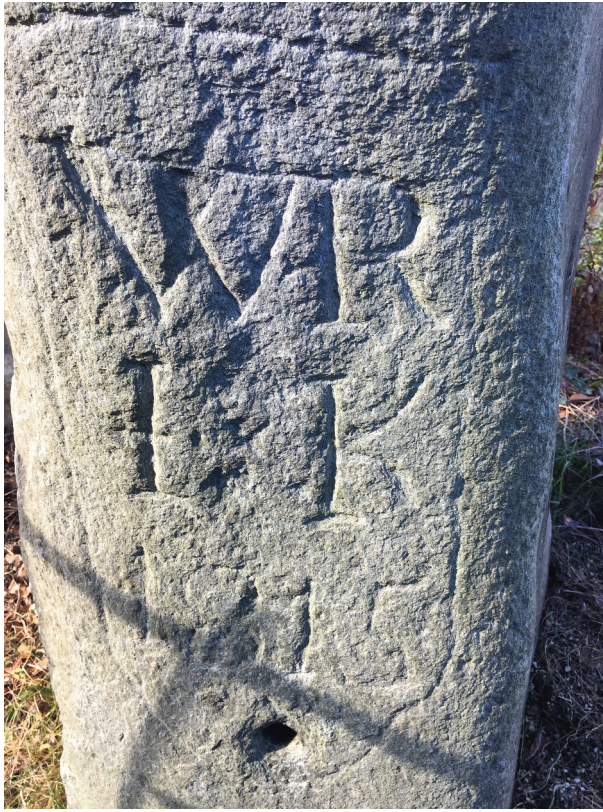
Figure 2. Nineteenth century Graffiti on the Kempock Stone' .

Granny Kempock is the one remaining constant in this curious, changing assemblage of cliff-edge features.