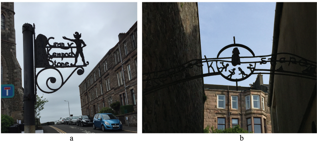
Figure 3. Ironwork sign 1 to the Kempock Stone’ and ‘Figure 3b Ironwork sign 2 to the Kempock Stone’.

More distinctive are two ironwork signs (see Figure 3 ) The first is sited at the entrance to the stairs that lead up to the megalith from Kempock Street and is composed of three iron bars affixed to the walls of the narrow passage with a circle wrought in the centre. Either side of the centre, are the words ‘Kempock’ and ‘Stane’ that enclose an approximation of the stony form and four circling figures performing a ritual. The other iron sign is attached to a pole opposite the extension of Burgh