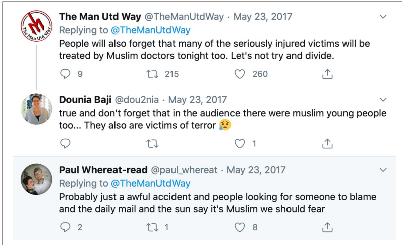
Figure 9. Example response to content shared by @TheManUtdWay http://Twitter.com/TheManUtdWay/statuses/866803692644782080 .

violence, or banal social actors who are first responders, but also victims of violence overtly perpetrated in the name of their religion.