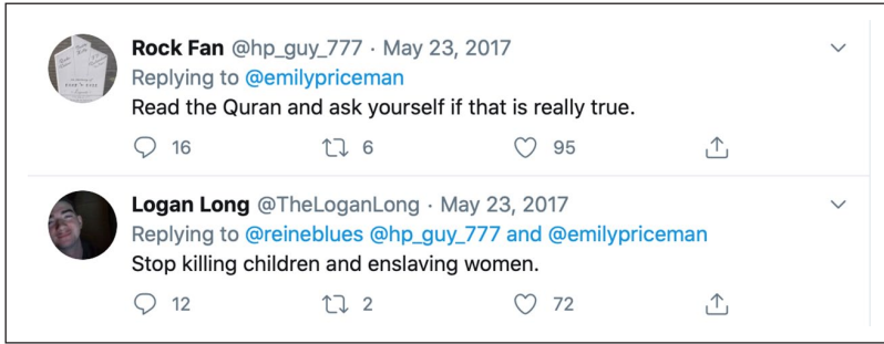
Figure 3. Response to @EmilyPricema.