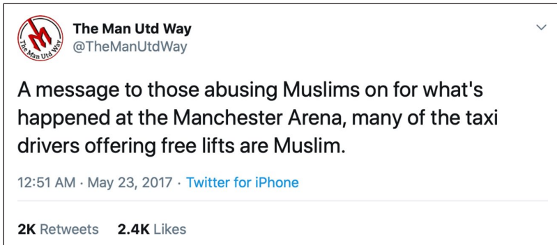
Figure 8. Content shared by @TheManUtdWay http://Twitter.com/TheManUtdWay/statuses/866803692644782080 .