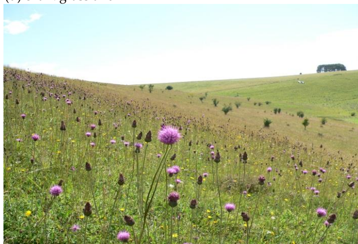
Figure 1. Photographs showing habitats in the Salisbury Plain area of Wiltshire including: a) cropland; b) rivers and wetlands; c) woodlands; and d) chalk grasslands.

The habitats and landscapes of Wiltshire are fairly typical of lowland England, where much of the UK population lives. Wiltshire is a landlocked county with an overall area of 3485 km 2 . It is home to some of the most famous English monuments and historical sites, such as Stonehenge, Avebury, Old Sarum, and Salisbury cathedral. Wiltshire is a rural county with a high proportion of cropland and agricultural grasslands. About one-fifth of the area of Wiltshire is occupied by the Salisbury Plain chalk plateau, which is the greatest remaining area of ancient chalk grasslands in north-west Europe. Much of this area of high biodiversity value is used by the UK Ministry of Defence for military exercises, which has restricted building and arable land use. According to the last census that took place in 2011, there were 470,981 residents in Wiltshire [30].