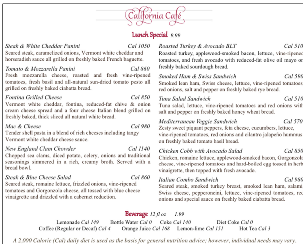
Figure A7. California Cafe Sweet Spot Menu.