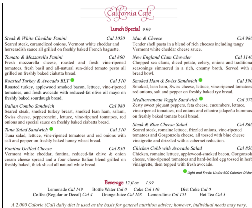
Figure A8. California Cafe Light and Fresh Menu.