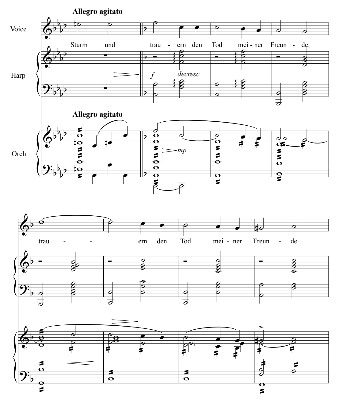
Example 9. "[mein Geist] im Sturm und trauern den Tod meiner Freunde."

prominent harp chords, novel in the texture, embroider the pizzicato lower strings and bring the work to a close (example 9): "[mein Geist] im Sturm und trauern den Tod meiner Freunde."