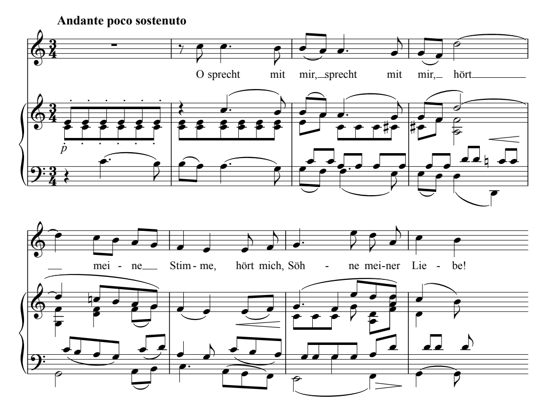
Example 8. "O sprecht mit mir."

The twenty measures of lament gradually give way to a C-minor passage in which Colma calls on the spirits of the dead and asks where she may find her departed. The agitated cry, "Keine schwache Stimme tönt im Winde" excites a sudden eighth-note descent of the upper strings and violas stepwise over two octaves, continued by the cellos and basses to a low G. Colma then sings, still in C minor, "Ich sitz' in meinem Grame und harre des Morgens mit Thränen." Lachner realizes the doleful cast of the text (mm. 397 following) by employing the cello and first violins to play a slower version of the downward-moving motif, especially at "Errichtet das Grab, ihr Freunde der Todten, doch schliesst es nicht bis Kolma kommt!" The nine-measure recitative in which she declares she will lie beside her friends closes with the downward eighth-note motif, this time in the flute, as the music returns to the Allegro agitato of the opening.