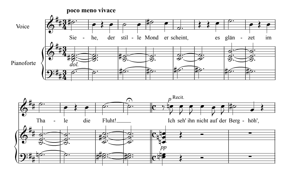
Example 3. "Siehe der stille Mond erscheint."

The final segment of the setting is an extended Andante sostenuto of 57 measures in E minor—B major, mainly with pianissimo eighth notes in the piano part for "Gebt der Gruft die Todten, o Freunde," until strikingly, against a C#-minor chord, the voice moves into a curving cantilena on the second syllable of "ertönen" at the phrase, "süsse Laute soll die Stimme ertönen um meine Geliebten, sie waren Colma so theuer" (example 4).