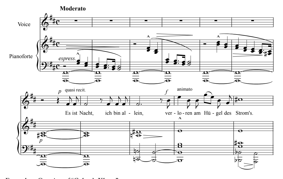
Example 2. Opening of "Colma's Klage."

The Wagnerian drift of the setting is established from the start, as the bass in the piano part holds a low pedal F# against a threefold procession of thirds in the right hand that begins as a dissonant B-G and G-E followed by a descent to a B-minor and finally an F#-major dominant cadence (see example 2). At that point the voice enters with the repeated intonation on F#, "Es ist Nacht, ich bin allein." This opening is reminiscent of quieter passages in Wagner's operas, even in middle-period works such as Tannhäuser , for instance, which Hiller helped to stage in Dresden in 1845; he attended a performance of that work in