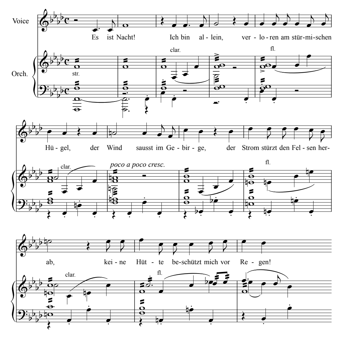
Example 5. "Es ist Nacht! Ich bin allein."

This extended introduction is also marked by a descending motif of six notes in the woodwinds that gives way, at m. 20, to a four-measure phrase in the first violins (marked dolce) before returning to the style of the opening restless pattern in the lower strings, with tremolando chords marked forte-piano. At m. 38 a new, slower figuration begins with solo flutes, clarinets, and bassoons, the strings silent until they resume the tempo with their tremolando Fs against low clarinet chords. This texture accompanies the vocal part for the next 23 measures (see example 6).