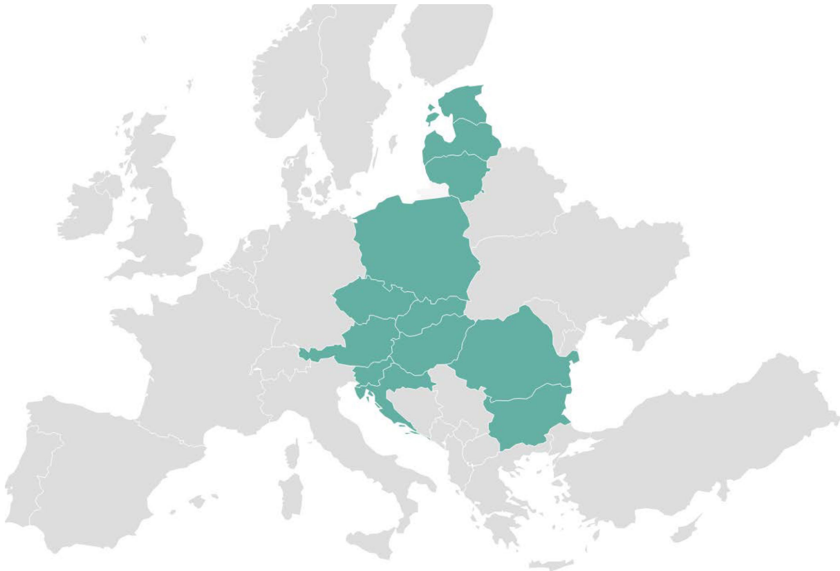
Figure 1: The countries of Central and Eastern Europe (CEE) included in this analysis