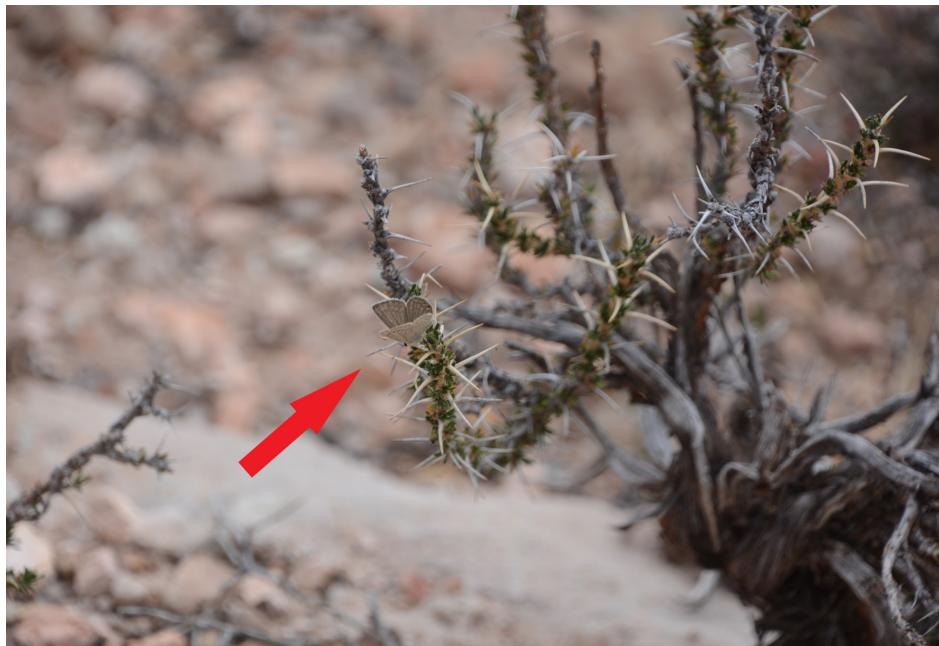
Fig. 2. Perching male of Pseudolucia jujuyensis Bálint, Eisele et Johnson, 2000 (indicated by the arrow), 9 km East of La Quiaca, Department Jujuy, northern Argentina at 3930 m, 9.XII.2018