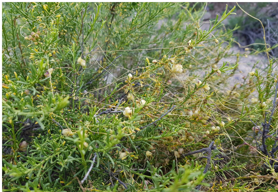
Fig. 4. Close up image showing Baccharis branches parasitized by Cuscuta sp.; at Yavi Chico, department Jujuy, northern Argentina, 3647 m, 13.II.2019