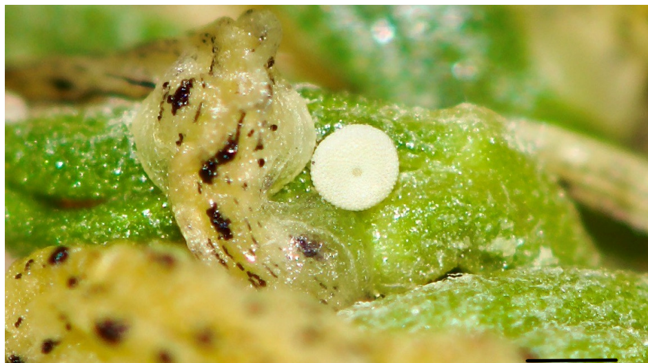
Fig. 5. Egg of Pseudolucia jujuyensis Bálint, Eisele et Johnson, 2000 placed near Cuscuta tendril in dorsal view, showing the typical polyommatae lycaenid flat shape with fine sculptured surface. Scale bar = 500 \mu m