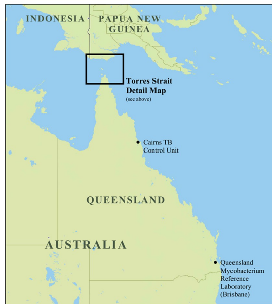
Fig 1. Map of the Torres Strait / Papua New Guinea cross-border region [16] 1 CC BY 4.0. 1 International travel without passport or visa is permitted for traditional inhabitants of the Torres Strait Protected Zone and Treaty villages of Papua New Guinea, DOI. 10.6084/m9.figshare.16632823 .

https://doi.org/10.1371/journal.pone.0266436.g001