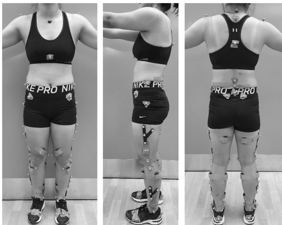
Fig. 2. Reflective marker and cluster (thigh & shank) placement based on 6DOF and IOR models.

Participants completed 10 x RVJ trials during each session, five on each limb. The order of limb trials was completed in a randomised order for each session, determined via a Random List Generator (Randomness and Integrity Services Ltd, Dublin, Ireland) computer program, to reduce anticipatory effects. Participants were required to run 7 m and pass through two timing gates at a standardised velocity of 14–16 km/h (4–6 m/s) (Chinnasee et al., 2018). They were instructed to complete a single limb jump off the first force plate to reach a suspended ball, landing on the ipsilateral limb on the second force plate (Fig. 1) (Chinnasee et al.,