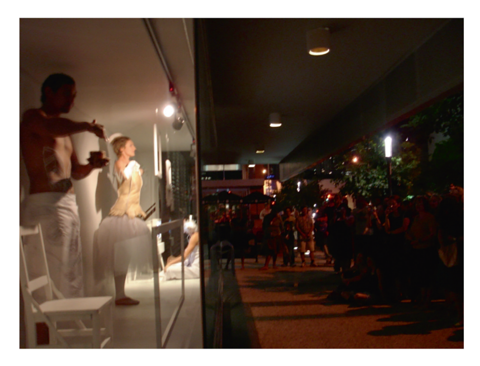
FIGURE 3 Polytoxic performance, 2006 © J. Fraser.

the context of a stronger presence of Pacific artists and the growing work of Pacific curators, which were both foregrounded at the Contemporary Pacific Arts Festival that took place in Melbourne in mid-May 2013, Keren Ruki inaugurated her own show in 2013, a project she had dreamt about for years.