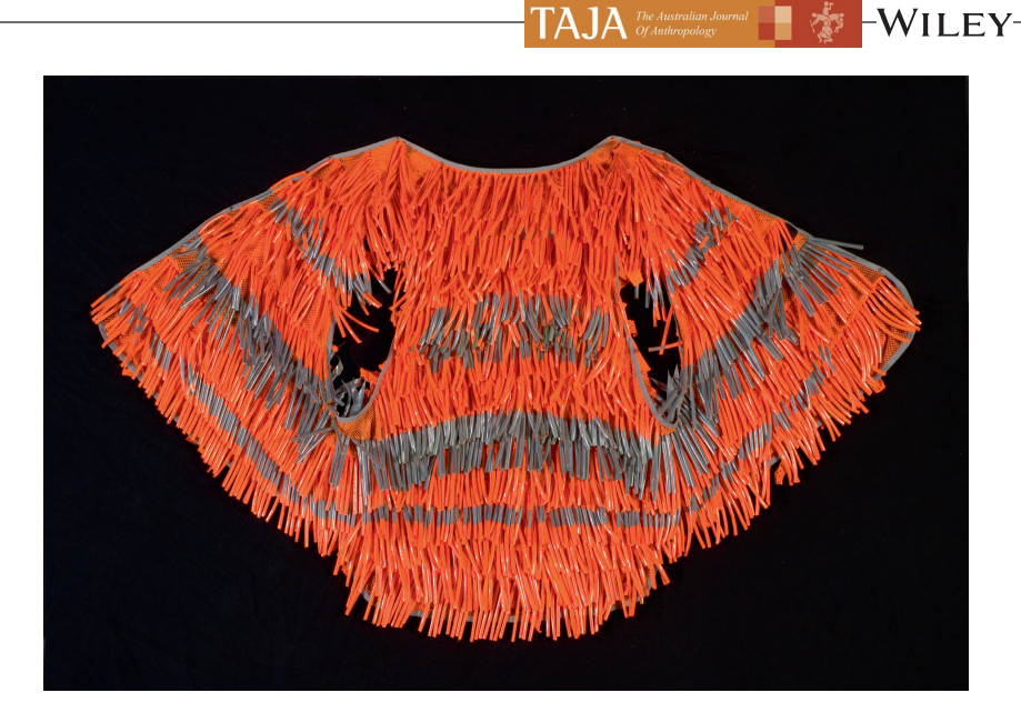
FIGURE 5 Keren Ruki, cultural safety vest , 2007, plastic tubing, nylon, reflexive tape, 80×60 cm © K. Ruki.