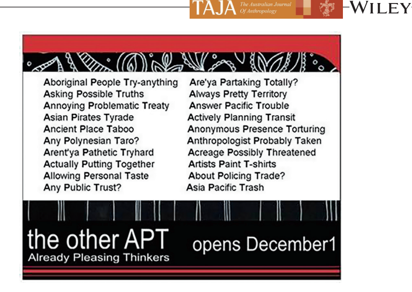
FIGURE 2 Flyer designed by Jenny Fraser for the first edition of the other APT © J. Fraser.