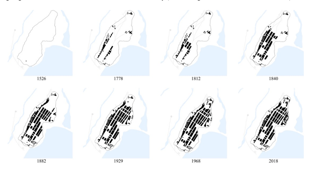
FIGURE 1. Urban development of the Plateau (from 1526 up to date)

Observing Fig. 1, we find that morphologically this layout is based on an orthogonal grid of regular blocks and that the strongest growth of the urban centre occurred in the 19th century (see drawings relative to 1812, 1840 and 1882).