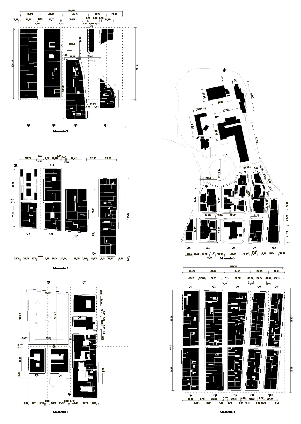
FIGURE 3. Urban grid of the Plateau at its 5 stages of development (2018)

Stage 5 refers to the 20th century, when the core settlement was consolidated with the construction of the secondary school, in 1960 (Fig. 3). The northern part of the Plateau was built on after the 1940s lending continuity to the same system of urban composition. The central blocks emerge extending the urban grid and the blocks of the upland's borders adapt to the topography of the site. With the completion of Praça do Liceu (secondary school square), Rua Serpa Pinto henceforth links three important public spaces (the town's three main squares). The last blocks to be built have similar widths to the previous (44, 32 and 22 metres) as they arise in their continuity, but