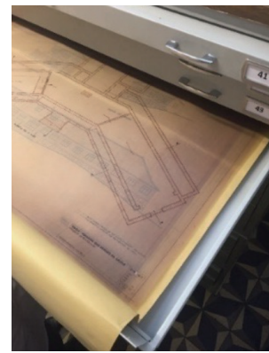
Fig. 2. Storage