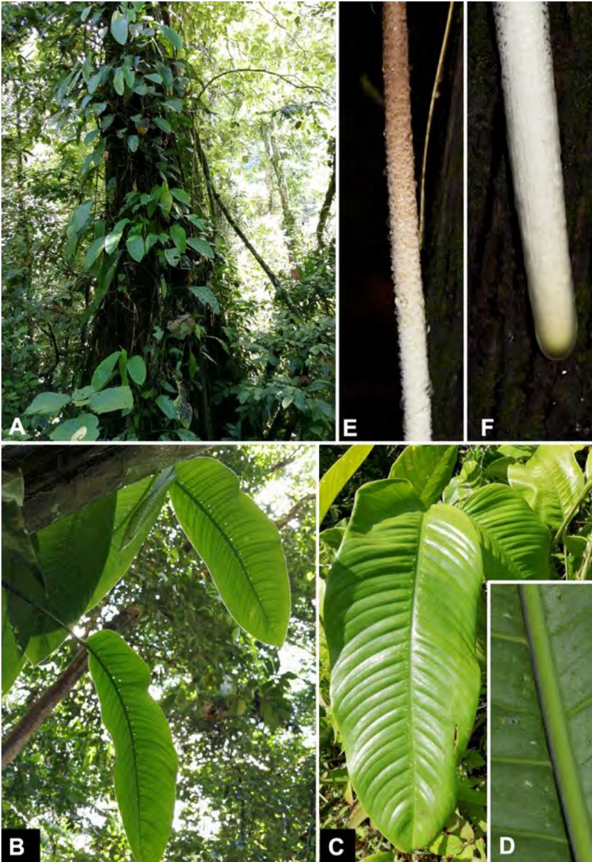
Figure 1. Rhaphidophora microperforata . (A) Plant in habitat. (B) Leaves viewed from below, pin-holes clearly visible. (C) Leaf blades in full sun. (D) Detail of leaf blade abaxial surface showing pubescent mid-rib and pin-holes. E & F. Feeding roots. Note the texture of the root (E) and the active root-tip (F). A & B from AR-2914; C from AR-3234; D–F from AR-2951.