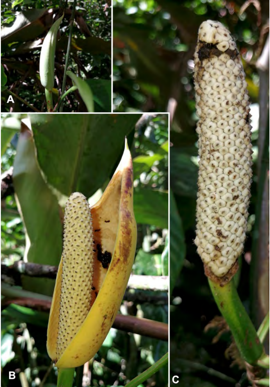
Figure 4. Rhabdophora muluensis . (A) Bloom in bud. (B). Bloom at late staminate anthesis. (C). Developing infructescence. All from AR-2917.