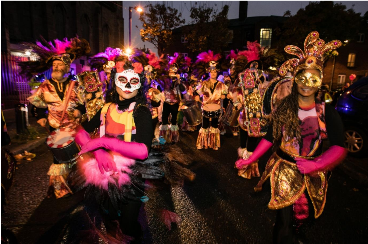
'The Big Scream' Halloween Festival 2019 in Dublin's NEIC, a 'fun zone' for the community