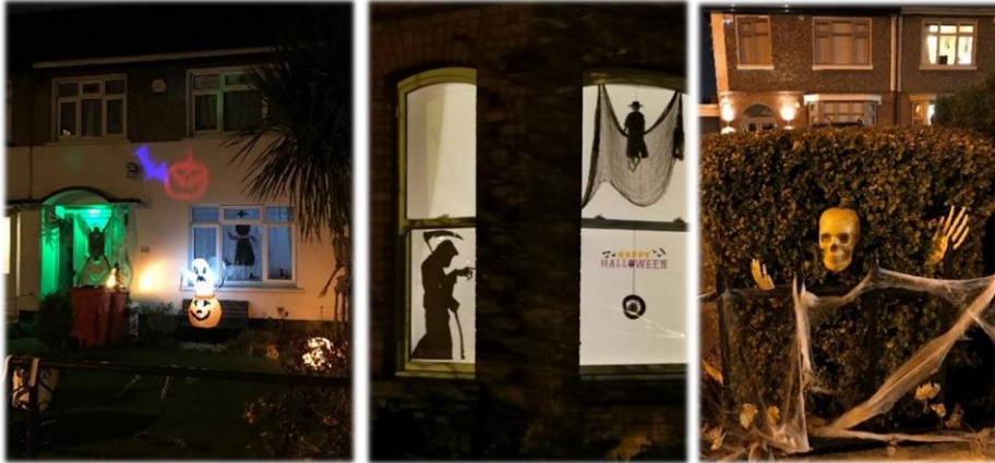
Ghostly decorations in houses and gardens across Dublin, Halloween 2020

The festival has now become a secular event, where participants make few conscious connections to its historical and religious heritage. For many it is an important social ritual, a multivocal festival that crosses cultures and boundaries, that is able to serve children, adolescents, and adults in different ways and with different meanings (Belk 1990). Participation in Halloween celebrations serves many different functions (Piatti-Farnell, 2020), including, as Belk (1990) suggests, the ability to transcend normal rules of propriety and relieve the tensions of social order. It is perhaps because of this that Halloween can sometimes be associated with anti-social behaviour. The lighting of unofficial bonfires and the illegal use of fireworks in public spaces across Dublin city, for example, has been a frequent occurrence at Halloween. Such behaviour causes not only physical and criminal damage to local parks and public spaces, but also anxiety and fear for locals.