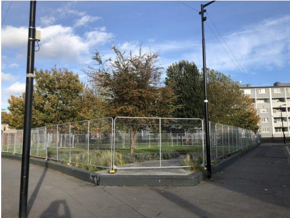
Fencing constructed around a small park in Dublin 8, in an effort to prevent illegal bonfires & fireworks

In Dublin's North East Inner City, 'The Big Scream' underwent a virtual reinvention, but its on-street carnival, such an important feature of the event, was cancelled. Nevertheless, engaging with the parks and spaces in the NEIC area remained an important feature of the festival. While physical gatherings were not possible under COVID-19 restrictions, engagement with local parks and spaces was encouraged through for example, the organisation of fairy trails, 'find the fangs' events as well as scavenger hunts. Streets and parks became a veritable gallery of portraits of children and adults from previous years' festivals. These posters graced buildings, streets and park railings throughout the area, adding colour and vibrancy and providing a sense of the carnivalesque atmosphere of previous years' festivals. Children were encouraged to take photographs standing beside their portraits and to share on social media, and competitions for counting the number of portraits decorating the various building and park railings around the NEIC took place.