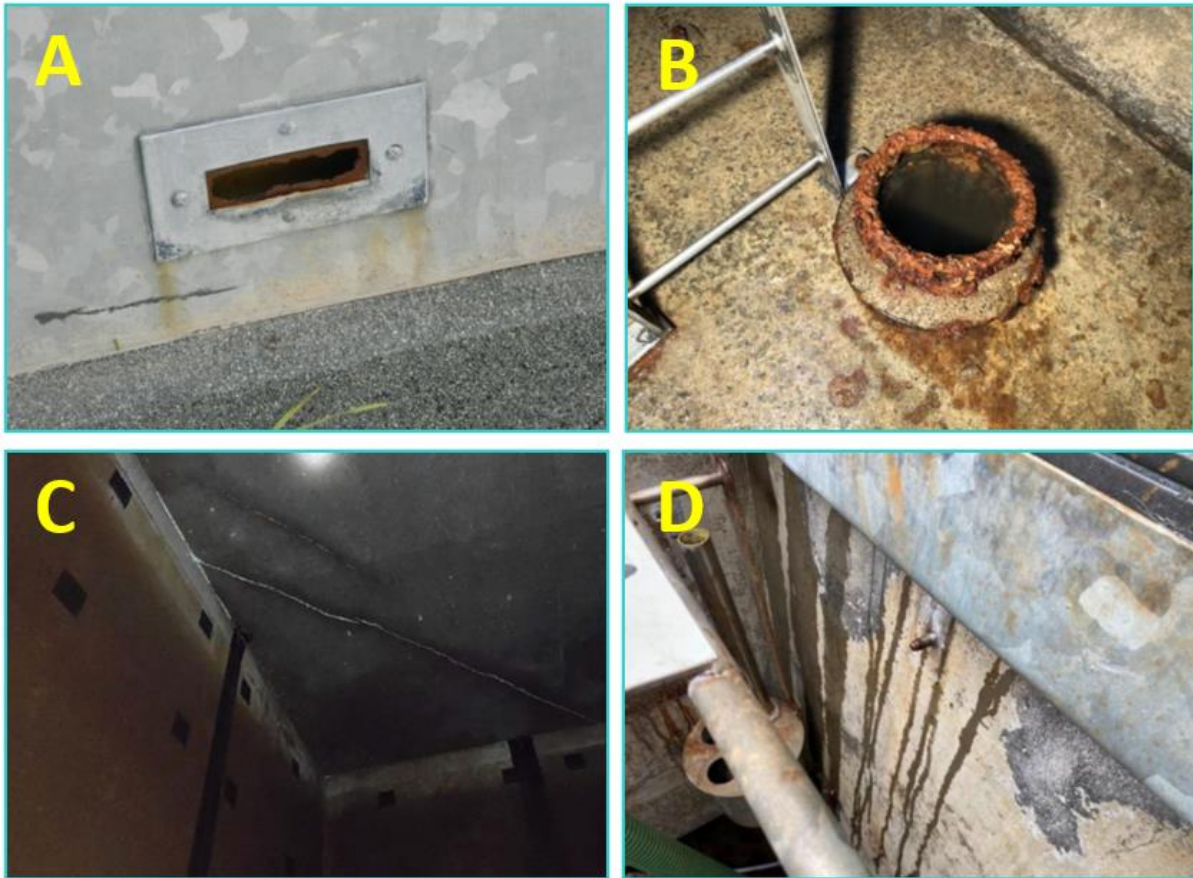
Figure 1 – A collection of photos showing some common issues seen in service reservoirs: A broken and corroded air vent (A), corrosion of internal structures (B), staining on walls and cracks in the roof (C), and ingress through the seam of an access hatch (D).

Despite the association of increased contamination risk with older SRs, there is a lack of evidence to suggest that there is a genuine relationship between the two. Although water quality deterioration is often associated with older and more stressed systems, problems also arise in new or recently improved ones (Brandt et al., 2016). Additionally, age does not always correlate with structural issues, which is evidenced by a significant number of SRs built in the 19th century that are still fully functional to this day.