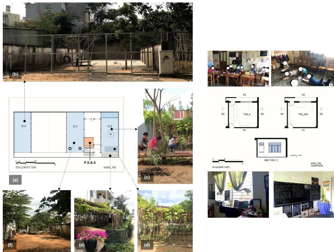
Figure 4. HCMC_TXS studied playground areas and two classrooms. (a) Studied classrooms and playground areas; (b) the area for multi-playing activities; (c) the area for children studies outdoor and play, including (d) a vegetable garden; (e) a vegetable garden at the front gate; (f) the sand playground area