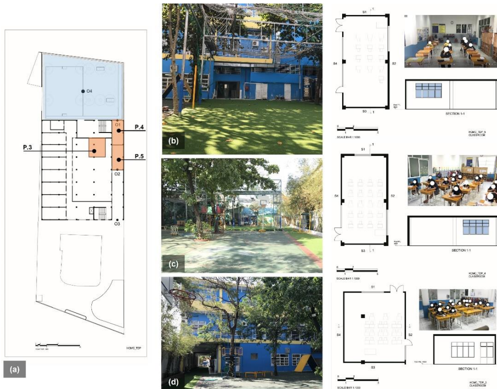
Figure 3. HCMC_TDP studied playground areas and classrooms. (a) Studied classrooms and playground areas; (b) the artificial-grassed playground area; (c) and (d) the views of playground area and corridor of school building.