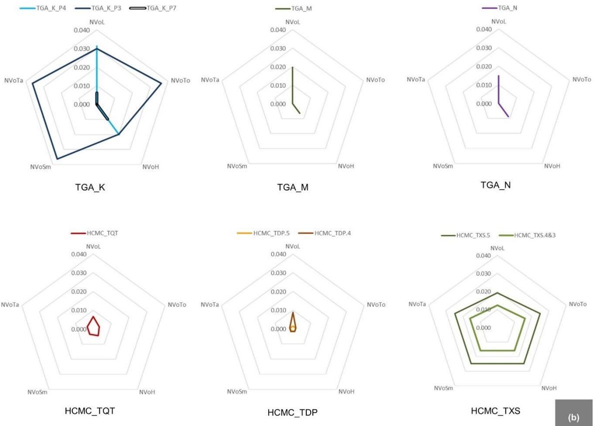
Figure 6. The naturalness value of visual and non-visual senses within the playground areas (a) and the classrooms (b) of three TGA and three HCMC primary schools