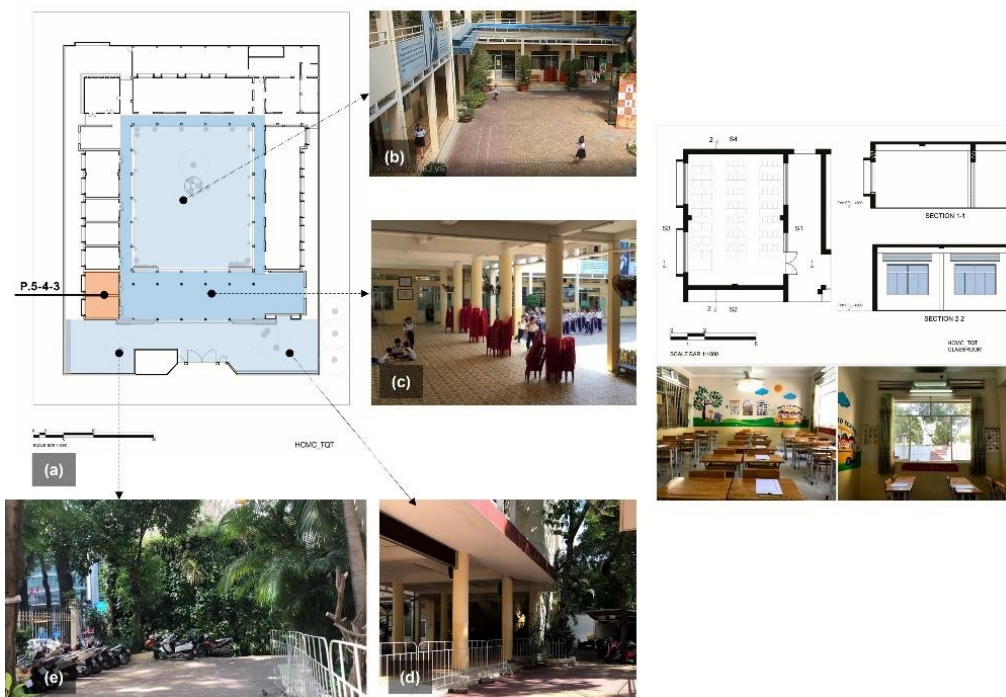
Figure 2. HCMC_TQT studied playground areas and classrooms. (a) Studied classrooms and playground areas; (b) The view of main playground from the first floor; (c) the in-between playground area for multi-functional purposes; (d) the left side of playground area at the entrance gate (visitors parking included); (e) the right side of playground area at the entrance gate (parking included).

Tre Xanh Steiner school locates in a residential area of District 2, a developing district (Figure 4). This home school belongs to the Steiner educational system, in which Waldorf students, especially from 7 to 14 years old – the period which emphasizes establishing a 'healthy moral foundation', are nurtured to be aware of natural beauty and to be in harmony with nature through nature-based settings in classrooms and outdoor activities. There were only 4 classrooms within the house. Two classrooms of students grade 5 (TXS_P5) and grades 4 and 3 (TXS_P4.3) had the same layout while on different floors. Besides, the significant feature of Waldorf classrooms is the "Nature" table exhibits natural elements that reflect the rhythms of the seasons. The school rented three pieces of vacant land which to create three different playground areas for various kinds of pupils' outdoor activities.