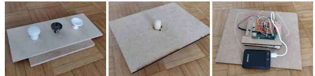
Figure 3: Prototypes B1 and B2 (front and back)

determining whether the sakis would find the interface intuitive. As buttons had not previously been explored with sakis, there was no prior work to build upon. We considered that a monkey's interaction with a button could be initiated by touching, touching and pushing, or touching and pulling. In addition, the properties of a button, such as its shape, size and material, could contribute to the intuitiveness of its use, offering better usability by matching the sakis' perceptions and capabilities to the button's affordances (DR1). For example, a button that fits into a saki's hand promotes an ergonomic physical interaction mechanism involving the hands. In addition, the properties of the button, such as the colour or texture [27], could affect whether the sakis found it interesting and chose to engage (DR2). For these prototypes, we mostly used wood as the building material as it could withstand the sakis' biting and other exploratory behaviours, and scrap pieces were typically available at the workshop.