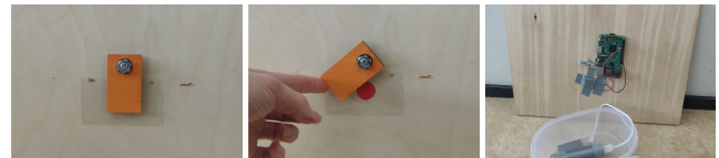
Figure 6: Prototype B9: Front, revealing of the red dot and the technology in the backside.

5.4.1 Building the Prototype. In the final stage of prototyping, we extended the B8 design concept to a higher-level prototype (B9, Fig. 6) that tested the interactive features. We added hardware built into the mechanism to detect the movement of the panel button, including a magnetic switch and a magnet as well as a Raspberry Pi and a portable charger. These adaptations meant that each movement of the button away from the centre point had the potential to trigger the detection mechanism (the magnetic switch), leading the software to automatically log the interaction.