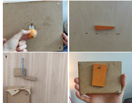
Figure 5: Prototypes B6, B7 (front and back) and B8

5.3.1 Building the Prototypes. For the third iteration, we deployed three prototypes (B6–B8, Fig. 5) that were bright orange in colour and sized such that the sakis could grip them easily. We chose the colour of the ball as orange because the sakis had earlier learned to react to this colour. Each button exhibited a different type of movement. Furthermore, B8 afforded movement mimicking a toy the sakis had used previously (a dog puzzle). B6 was a revised version of B4, comprising a pull button made of a wooden ball attached to a jute string. The ball was smaller than that in B4, facilitating easier movement, and the pull distance was longer (the ball could be pulled for approximately 15 cm). When released, the ball returned quickly to its original position tight against the plywood. B7 involved a lever button (a concept suggested by the keeper) built from wood, which sprang back into place after being pressed down. B8 comprised a movable wooden piece (a 'panel') mounted on an axle (a screw), hiding a red dot when in the neutral (downward) position. To see the colourful dot, the wood had to be moved. It