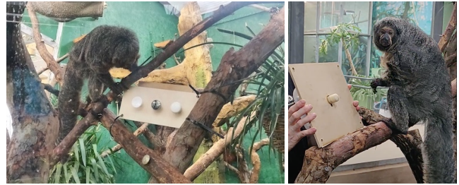
Figure 2: Testing prototypes B1 and B2

5.1.1 Building the Prototypes. We began designing the buttons with the interaction mechanism, as this was the core concept for the design of a tangible button and a pressing factor in terms of