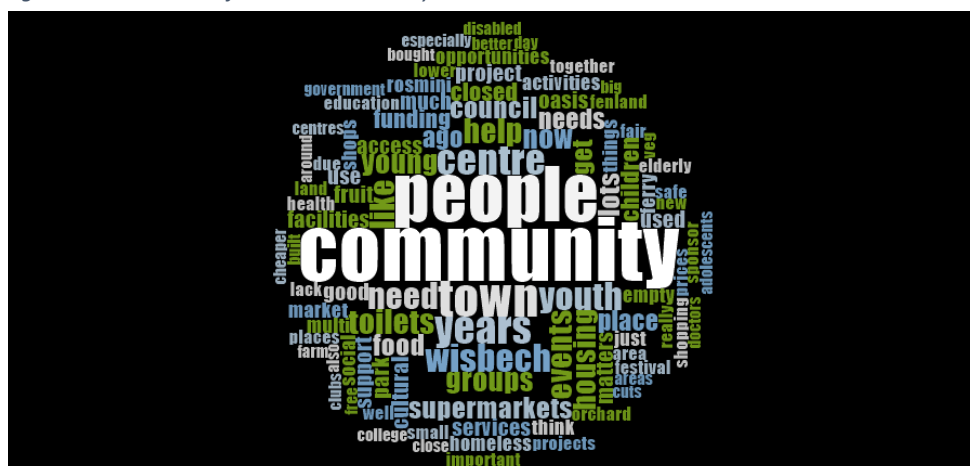
Figure 2. Word Cloud of the most commonly used words in interview notes

“Making sure people who are struggling can get food, heating, housing, fuel.”