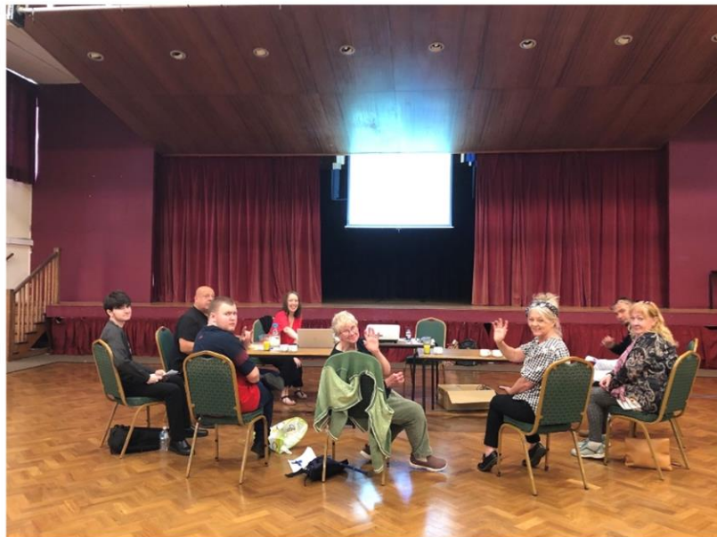
Figure 1. Community Research Training with the Wisbech group