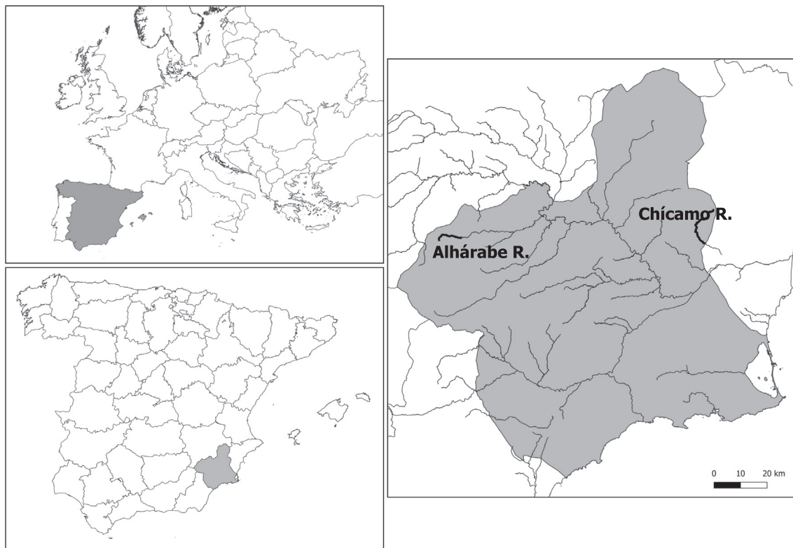
Fig. 1. Map of the study area, located in the South-East of Iberian Peninsula. The studied transects of Alhárabe and Chícamo Rivers (tributaries of Segura River) are indicated with a wider line.

macroinvertebrates. Additionally, a subsample of each macroinvertebrate group was preserved in 70% ethanol for taxonomy purposes and FFG assignments.”