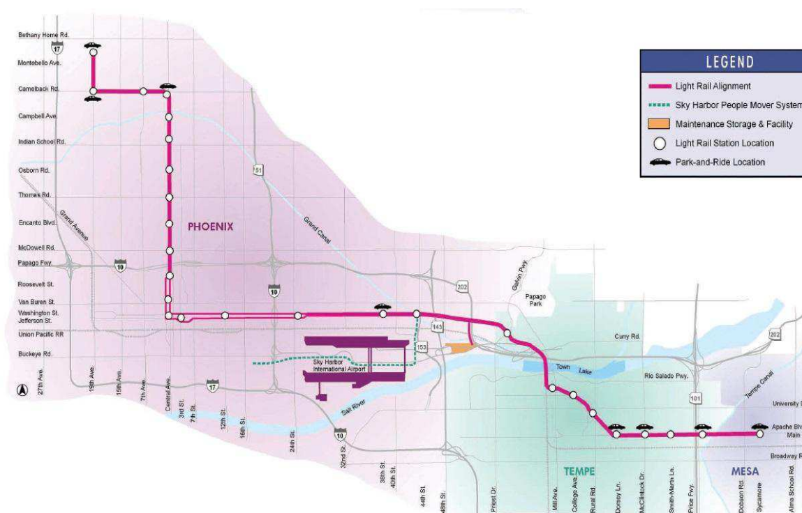
Figure 2 – The actual light-rail system in the Phoenix, Tempe and Mesa