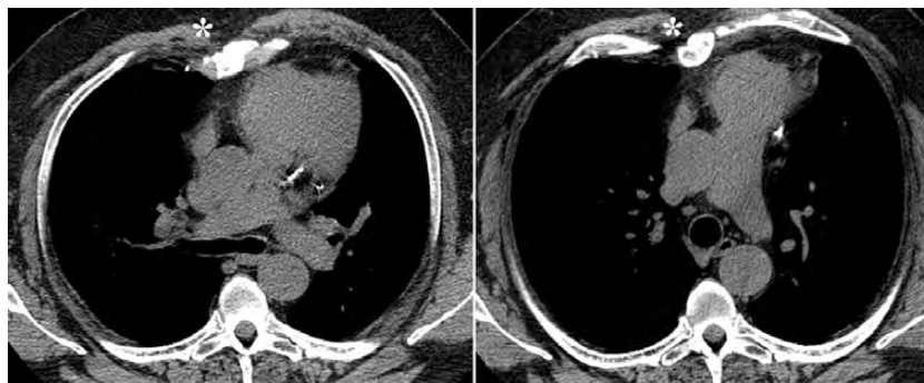
Figure 4: Dynamic study with a cine-scan mode in axial view, during normal breath, on operated patient, showing the asymmetric movement of the chest and the sternum (*).