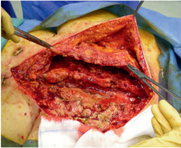
Figure 2: Detachment of the pectoralis muscle from the chest wall and from the subcutaneous layer.