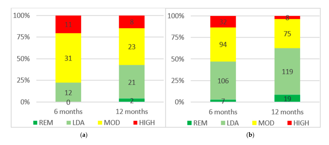
Figure 3. DAPSA scores at 6 and 12 months in PLG (a) and RWG (b). REM remission, LDA low disease activity, MOD moderate disease activity, HIGH high disease activity.