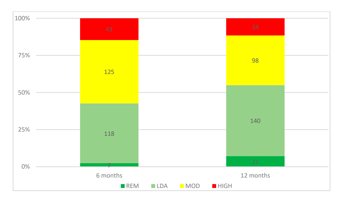
Figure 2. DAPSA scores at 6 and 12 months. REM remission, LDA low disease activity, MOD moderate disease activity, HIGH high disease activity.