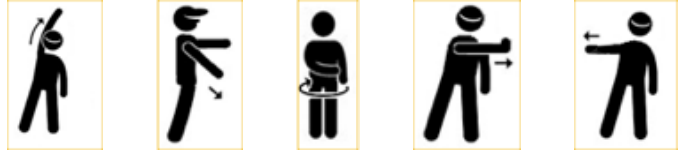
Fig. 2. Gestures considered in this study: from left to right, Up , Down , Circle , Left and Right . Animated examples can be seen in the multimedia attachment to [2].

ROS can be, then, used for implementing the remaining of the pipeline [37]. It is an open-source hardware-independent middleware widely used in robotics and consists in a set of software libraries and tools that allow communication with robots, actuators, sensors and other devices commonly used in robotic applications. Since it supports Python, it can deal with data acquisition, data processing, gesture recognition and communication with the robotic platform. To this end, a publish-subscribe pattern can be used that can efficiently handle communication events, such as arriving messages and inform the robot about the detection of a gesture.