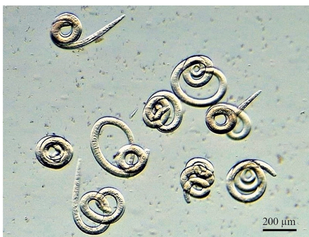
Fig. 2. Trichinella spp. L 1 larvae found by HCl-pepsin method in a diaphragm pillar sample of a wild boar collected in southern Italy between 2015 and 2021.

95% CI: 95% confidence interval; NA: not applicable; p: p-value with statistical significance < 0.05 ; Pos/Tot: number of positive samples on the total examined.