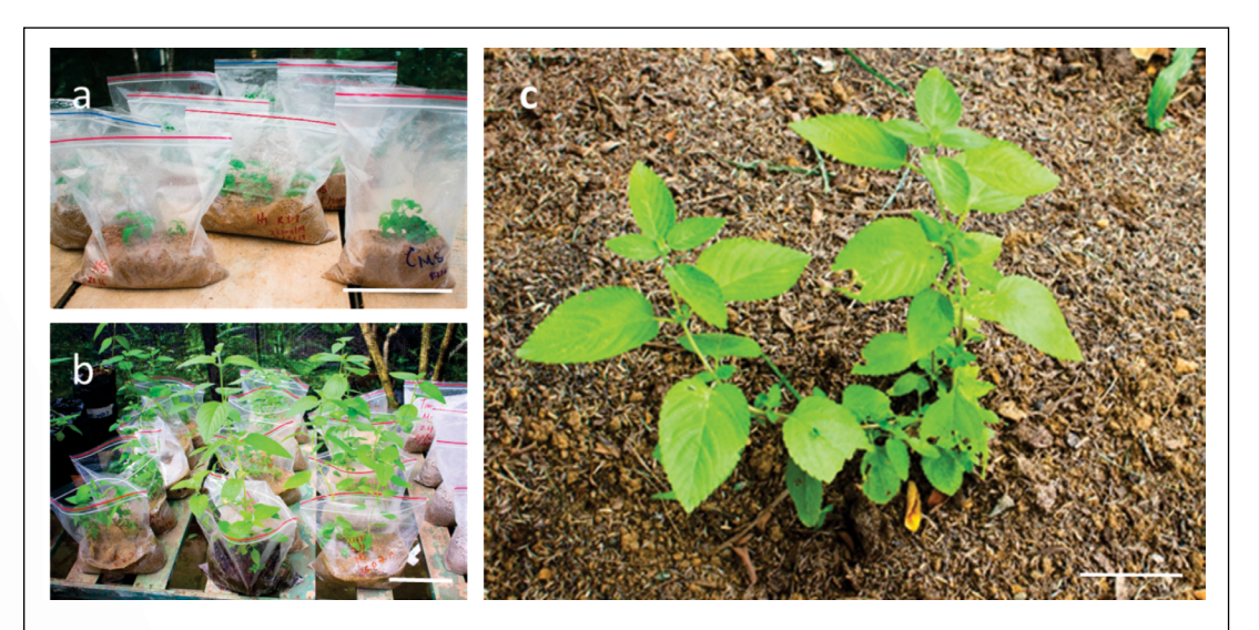
Figure 1 - L. origanoides plantlets (phellandrene chemotype) in the adaptation phase. a. Plantlets recently transplanted in bags; b. Plants adapted for 4 weeks; c. Field transplanted plants (6 weeks). Scale bar (10 cm).

detected from nodal explants cultured on MS medium with 0.1 mg L<sup>-1</sup>NAA and any concentration of BAP. In other Lippia species the addition of BAP also favored callusing at the lower end of the nodal stem explants (CASTELLANOS-HERNÁNDEZ et al. 2013, GUPTA et al. 2001; JOSÉ et al. 2019; MARINHO et al. 2011; RESENDE et al. 2015), including the study of L. origanoides from Brazil (CASTILHO et al. 2019).