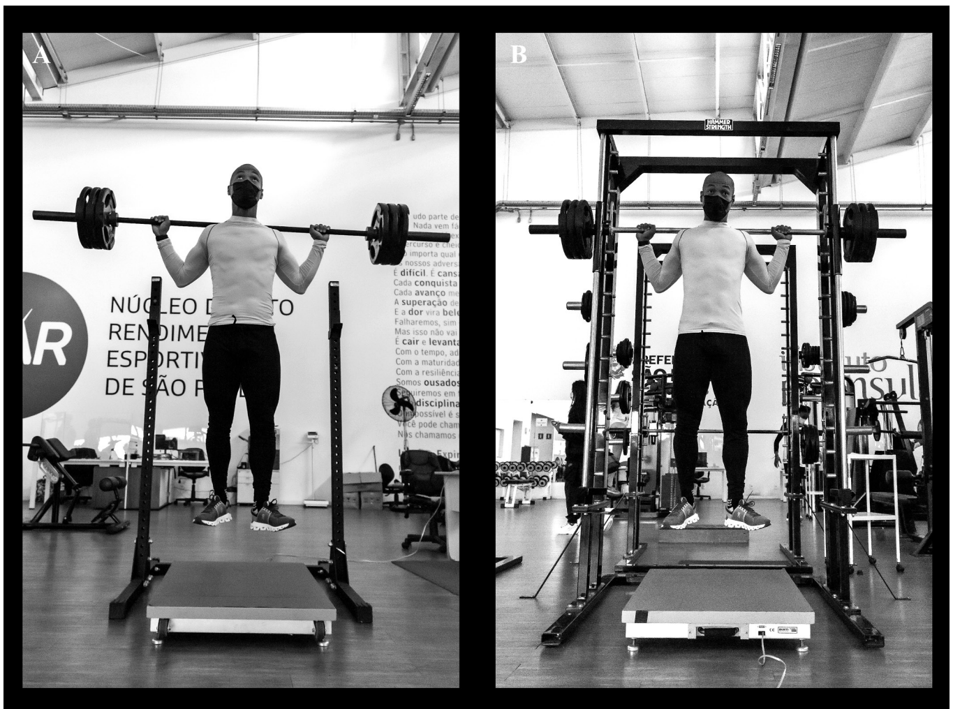
FIG. 1. A sprinter performing free weight (A) and Smith machine (B) loaded squat jumps at 100% of body mass.

Additional studies have compared the performance obtained by different athletes during the SJ exercise executed at distinct loading conditions, with a special focus on elite sprinters. McBride et al. [12] reported that sprinters with a relative strength (RS; 1RM/body mass [BM]) of \sim 2.65 achieved, on average, jump heights equal to 23.9 and 14.1 cm at 30 and 60%1RM (or at \sim 80 , and 160% BM), respectively. In a reference study on loaded SJ, Loturco et al. [13] reported the same values for elite sprinters, who achieved, on average, 23.4 cm during SJ trials executed at 80% BM. A previous study also examined the height achieved by top-level sprinters and jumpers during loaded countermovement jumps (CMJs) and revealed that at 40–45% 1RM, these athletes were able to jump between 20.9 and 22.5 cm [14]. These data also agree with those published by Loturco et al. [13] (20.3 cm for SJ at 100% BM or 42% 1RM; RS = 2.38), despite methodological differences in jump testing procedures (i.e., loaded SJ versus loaded CMJ). However, it is worth noting that in heavy-load (low-velocity) conditions (i.e., 100% BM), the potentiation effect of the stretch-shortening cycle may be greatly compromised, which possibly reduces its effects on jumping performance [15, 16].