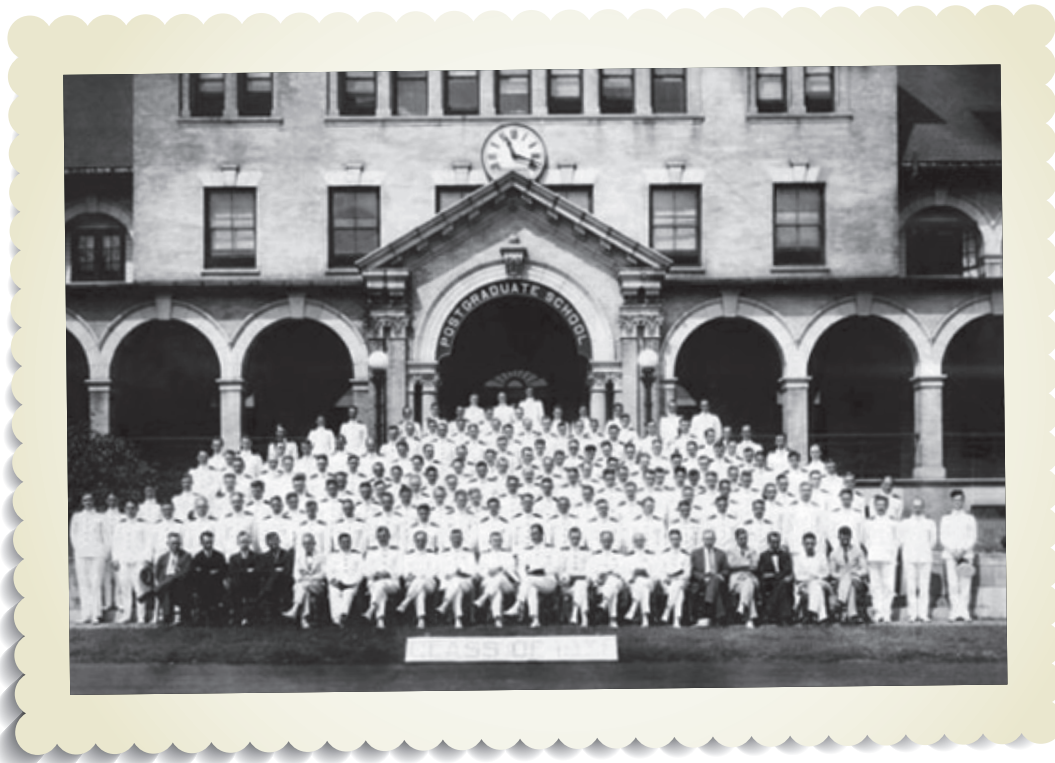
U.S. Naval Postgraduate School, Annapolis, Maryland, 1931