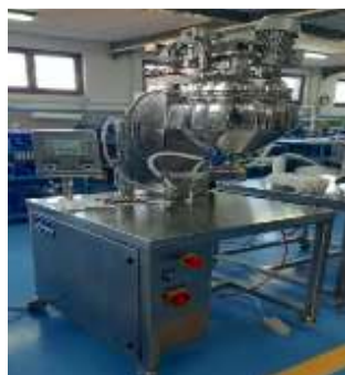
Figure 3. Homogenization mixer of producer OmniProjekt installed in our production site

The qualification process itself was implemented in the following order: