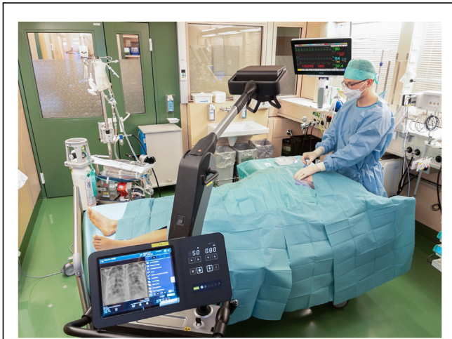
FIGURE 1 Dual-lumen cannulation using mobile x-ray device in intensive care unit. The x-ray device display is usually turned to the operating team.

patients died of multiorgan failure during ECMO support. No cannulation-related deaths occurred.