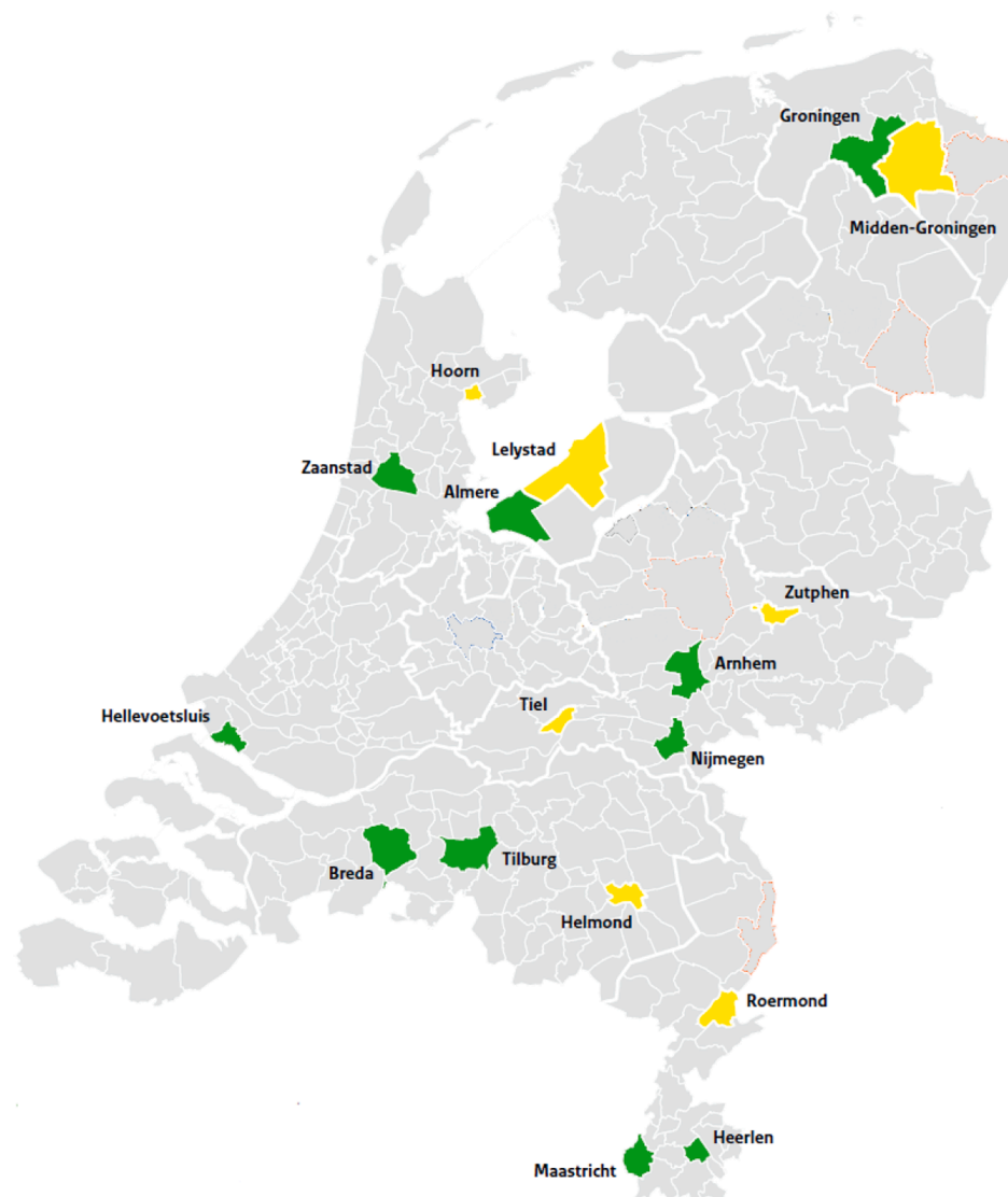
Fig. 2. Dutch experiment with a closed cannabis supply chain: geographic distribution of experimental municipalities participating in the intervention group (red) and nominated control municipalities (yellow). (For interpretation of the references to colour in this figure legend, the reader is referred to the web version of this article.)

information such as visits to hospital emergency departments, reported complaints about public order around sales points, and registered convictions will be used. Also for the comparison with adjacent municipalities and general national trends routinely monitored variables will be used. As a baseline for this comparison, the survey and the routinely recorded data for both the intervention and control municipalities in the year prior to the fieldwork will be used.