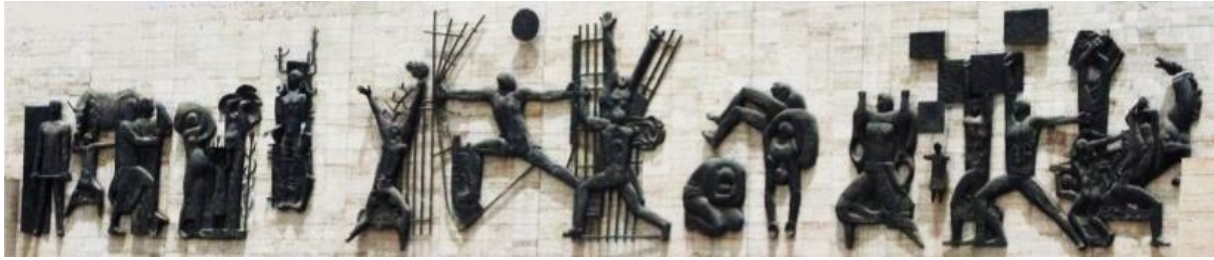
Figure (6): Jawad Selim

The artist (Jawad Selim) presented several works of sculpture with a symbolic significance far from direct or explicit expression, as he worked to transform the form into symbols and signs indicating the important issues that occupied the artist during his life, which achieved the semantic openness that expresses human freedom, destiny, destiny, and poverty. Where he embodied it in various artistic forms as in his works (The Freedom Monument) and (The Unknown Political Prisoner) (23), and the (Freedom Monument) as in Figure (6) expressed the artist's artistic insight and openness to the wide imagination and culture that he embodied in fourteen pieces inspired by the forms of art. Cylinder seals, which are printed on clay in intertwined stylistic directions, are executed by the artist in the form of an Arabic sentence that you read in his multiple texts with a full-meaning sentence from right to left (24). The level of construction is paralleled by another openness to textual structures that have become part of it, and thus he interacts with them and dialogues with them and, through this interaction, produces a new significance and a new position on the text and its time and history" (25), and the work of (political prisoner) as in Figure (7) was executed.