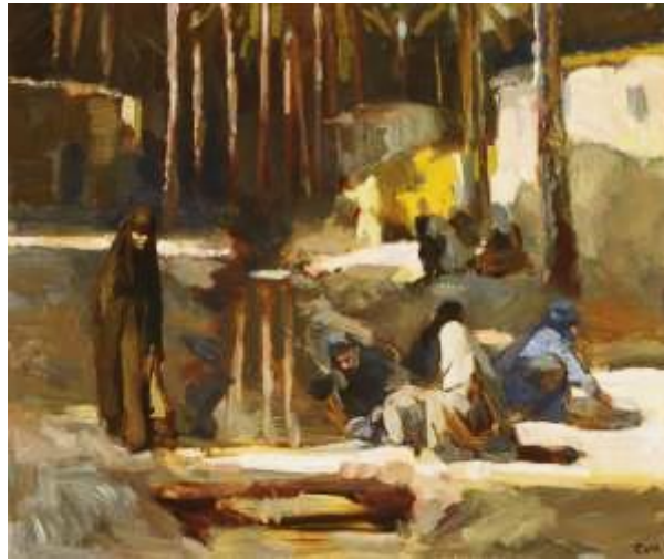
Figure (4): Faiq Hassan

As for the artist (Faeq Hassan, 1914-1992 AD), his paintings were characterized by the mutated natural forms, stripping the forms capable of sensory perception and expressing the human conscience. To indicate the heritage and the village environment, the artist touched in his paintings on topics that are indicative of the Iraqi environment with its earthy colors (16), as in Figure (4), where he expressed life in the village in a realistic manner with clear connotations through the delicacy of the line, the sensitivity of color and the forms of large areas, The color was distinguished by a static connotation. This feature characterized the life of villages in Iraq (17).