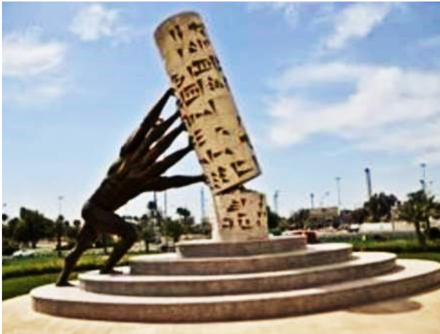
Figure (8): Mohamed Ghani Hekmat

As for the sculptor (Mohammed Ghani Hikmat 1939 - 2011 AD), his sculptural works expressed the suggestiveness of the composition of the artistic text with a diverse significance that does not stop at the limits of the surface structure, as in his work (Monument to the Rescue of Iraq) (28), as in Figure (8) the example of the work in the form A cylinder seal on which was written cuneiform letters with a symbolic significance that carry a semantic meaning of the language in its formal significance. The line appeared as signs and symbols bearing aesthetic values (29); That is why we see the artwork expressing a historical significance with an expression for the Iraqi culture so that the culture does not fall based on the hands and arms surrounding it from the side, and the symbols and writing crossed in the cuneiform script and its meaning (from here the writing began).