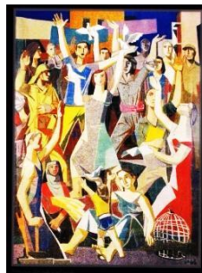
Figure (5): Faiq Hassan

As for the artist (Faeq Hassan, 1914-1992 AD), his paintings were characterized by the mutated natural forms, stripping the forms capable of sensory perception and expressing the human conscience. To indicate the heritage and the village environment, the artist touched in his paintings on topics that are indicative of the Iraqi environment with its earthy colors (16), as in Figure (4), where he expressed life in the village in a realistic manner with clear connotations through the delicacy of the line, the sensitivity of color and the forms of large areas, The color was distinguished by a static connotation. This feature characterized the life of villages in Iraq (17).