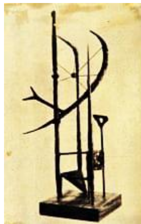
Figure (7): Jawad Selim

The artist (Jawad Selim) presented several works of sculpture with a symbolic significance far from direct or explicit expression, as he worked to transform the form into symbols and signs indicating the important issues that occupied the artist during his life, which achieved the semantic openness that expresses human freedom, destiny, destiny, and poverty. Where he embodied it in various artistic forms as in his works (The Freedom Monument) and (The Unknown Political Prisoner) (23), and the (Freedom Monument) as in Figure (6) expressed the artist's artistic insight and openness to the wide imagination and culture that he embodied in fourteen pieces inspired by the forms of art. Cylinder seals, which are printed on clay in intertwined stylistic directions, are executed by the artist in the form of an Arabic sentence that you read in his multiple texts with a full-meaning sentence from right to left (24). The level of construction is paralleled by another openness to textual structures that have become part of it, and thus he interacts with them and dialogues with them and, through this interaction, produces a new significance and a new position on the text and its time and history" (25), and the work of (political prisoner) as in Figure (7) was executed.