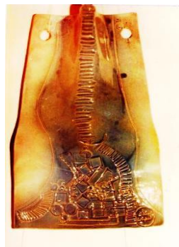
Figure (11): Siham Saudi