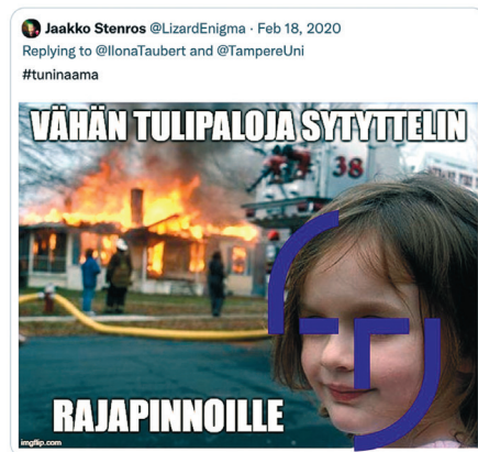
Figure 3: Version of the disaster girl with tuninaama

Note: The text reads: “I lit up wee fires on interfaces.”