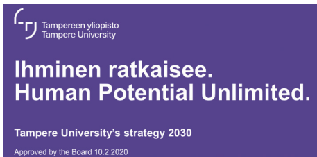
Figure 2: The new visual identity (aka tuniface) and slogan of Tampere University in Finnish and English

New types of stakeholders and the different emphases associated with them had also led to a change in the style and tone of external communication at Tampere University. Where, for example, university student recruitment was previously based on rather neutral and detailed information packaged in the most informative way possible, there now seemed to be an increasing desire to transform educational presentations and search tools into marketing tools (see also Svendsen & Svendsen, 2018).