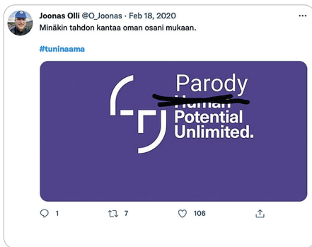
Figure 4: Tuninaama variation where the "Human potential unlimited" slogan is modified

According to Wiggins (2019), memes are used for constructing identities and raising self-esteem, but they also help bring marginal issues to broader attention, which also happened in the Tampere University case. Overall, while the main point of the visual variations was satire and parody, many of the tweets shared a more serious and critical undertone: Twitter users resisted the style and tone of Tampere University communications, which was seen