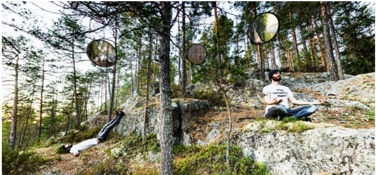
Figure 1. A screen capture of the 360 desktop-environment with interactive hotspots providing information boxes and/or voice narratives (same contents available for the 360-VR environment consumed with cardboards).

The artifact development began with filming the 360-environments. Contents for the MOOC -course were collected by showing the 360-environments for the experts with cardboards and interviewing them how that particular environment related to their work or research and what we should teach student about these topics. Interviews were transcribed, edited, and organized on a Moodle-based MOOC with multiple choice questions and short essay assignments. After that mockup of the interactive 360-environments were drafted to be used with desktop computers. The desktop-version the 360-environment could be explored by dragging with a mouse and hotspots were opened with a click. In a VR-version the surrounding was explored just turning the head and hotspots were opened after staring them few seconds while a countdown clock (a circle filling up)