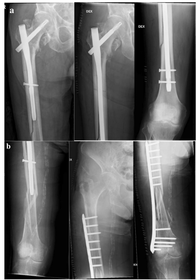
Fig. 2 Peri-implant fracture treated with nail removal and a exchange nailing to a long PFNA. b Open reduction and internal fixation with a locking plate

None of the patients needed additional surgeries for malunion, non-union, or delayed union after the initial surgery for the PIF. One patient had a post-operative surgical site infection after salvage treatment treated with a series of surgical debridements and intravenous antibiotics. The mortality after PIF was 7% at 30 and 90 days, 29% at 1 year, and 43% at 2 years. As a comparison, mortality after initial trochanteric fracture was 7% at 30 days, 14% at 90 days, 26% at 1 year, and 35% at 2 years, respectively.