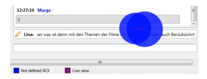
Fig. 3: Study result – eye tracking inaccuracy

Experiences from eye tracking chat-communication using the INKA-SUITE