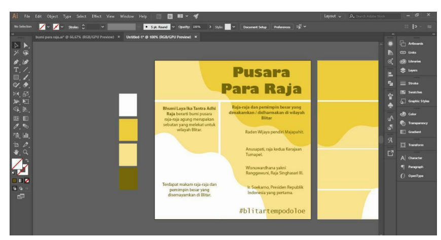
Figure 1. Typography on the infographic " Pusara Para Raja "

The following process is to add icons and symbols. Icons and symbols make it easier for the audience to understand the information. In Blitar, local content infographics, icons, and symbols added understanding and support visual displays. Icons and symbols are simple representations of an object (Wahyudin & Anto, 2019).