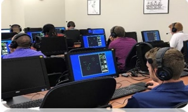
General Air Traffic/Technical Operations Lab