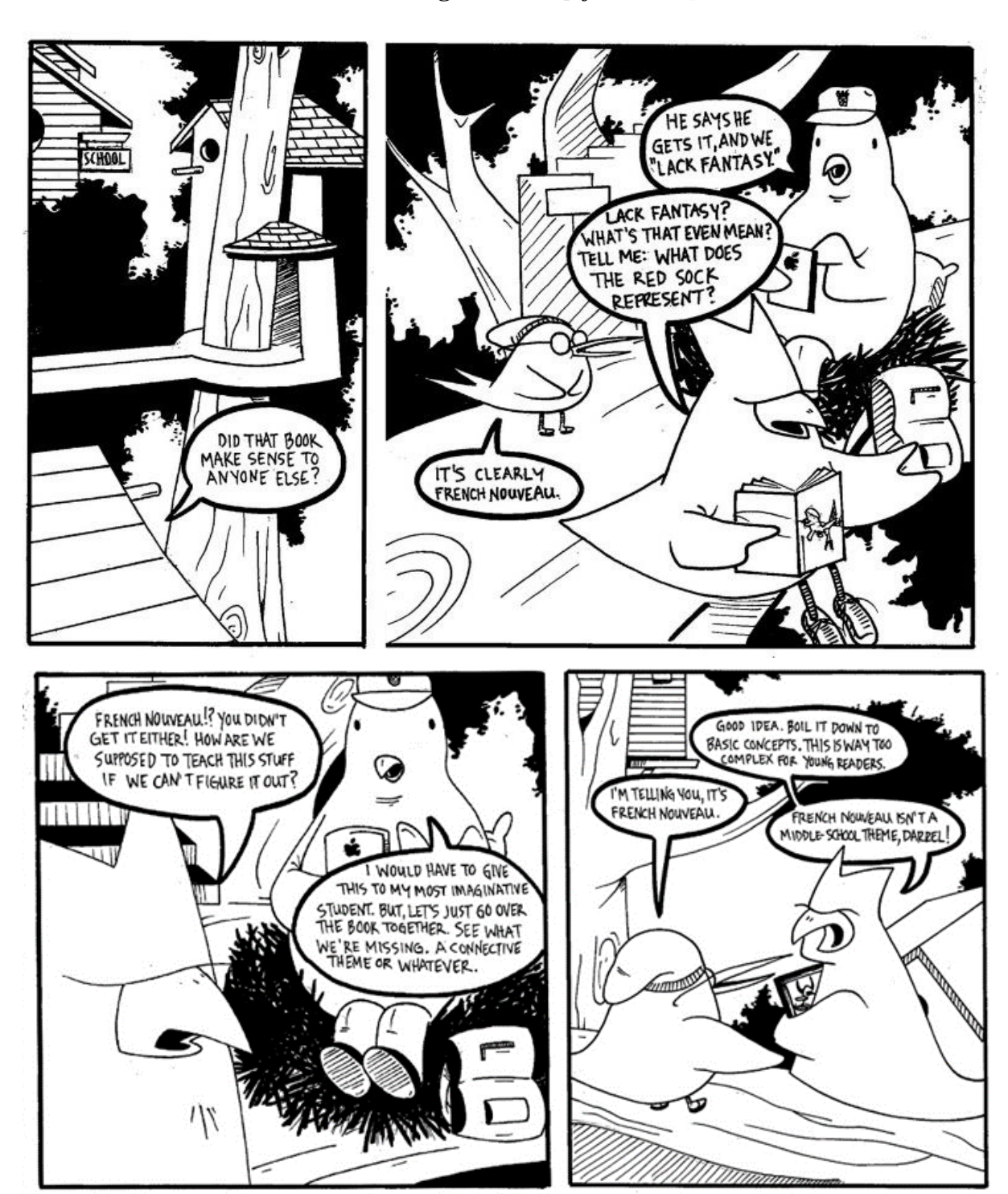
Figure. 1. Reading confusion.