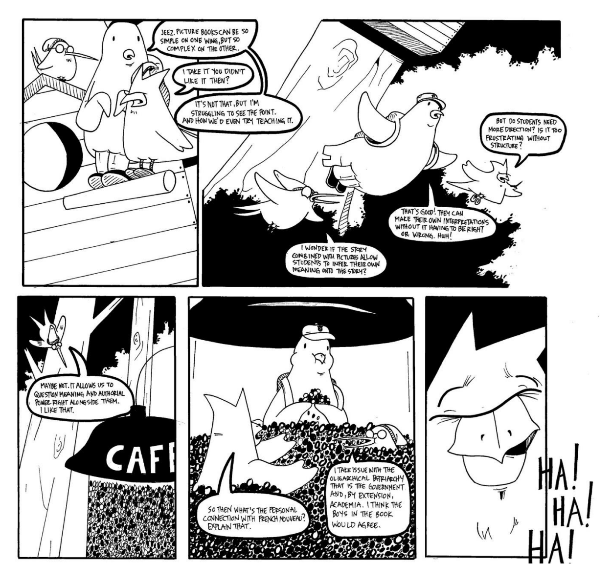
Figure 3. Questioning meaning.

[Dis]comfort in [Not] Knowing. Within the context of children's literature courses, preservice and practicing teachers read and engaged with both the digital and printed versions of Rules of Summer . Many students initially responded with dislike and confusion. Their frustrations align with current realities in schools where the focus is on single,